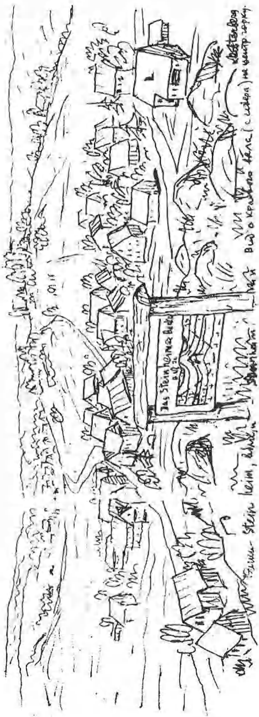
Steinheimer Basin. (Drawing made by E. E. Malinovsky)

Bowl-shaped depression, 1.9 mls/diameter, in the Alb highland with the village of Steinheim at the river Aalbuch. Upper Miocene marine sediments, rich in fossils. In the centre an uplifted Dogger cone (the Klosterberg). At the margin of the basin overthrust and shattered blocks. AMI BOUÉ (1824) interpreted this basin as effected by a gigantic whirlpool. Later volcanic interpretation was by subterranean laccolithes, at present this basin is recognized as a meteorite crater in connexion with the interpretation of the Ries. Shatter-cones. Core-drillings during the last decade revealed a downward decreasing dissipation. Same age points to a connexion with the Ries incident (Nördlinger Ries at a distance of about 25 mls; presumably a segregation of a meteorite at its entry into the gravity field of the earth).