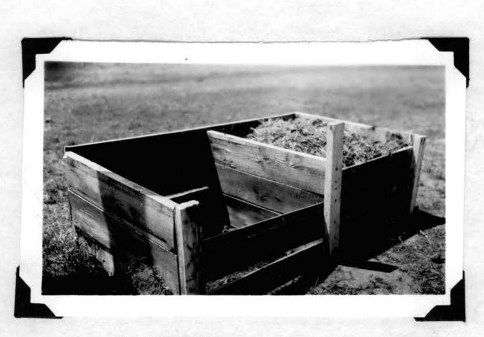
Figure 4. Front View of A New Zealand Compost Box Showing Details of Removable Front Panels.