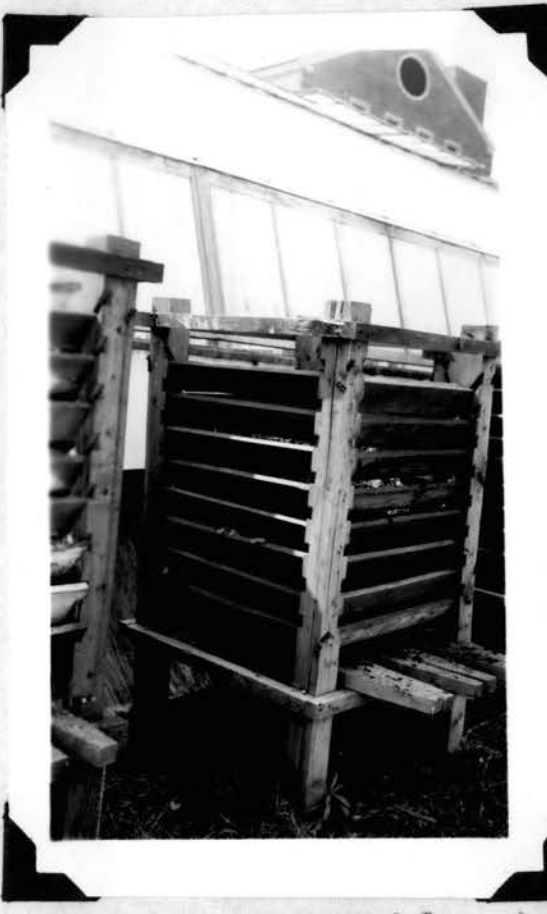
Figure 2. An Activated Compost Frame With The Solid Sides Removed to Show Details of Construction.