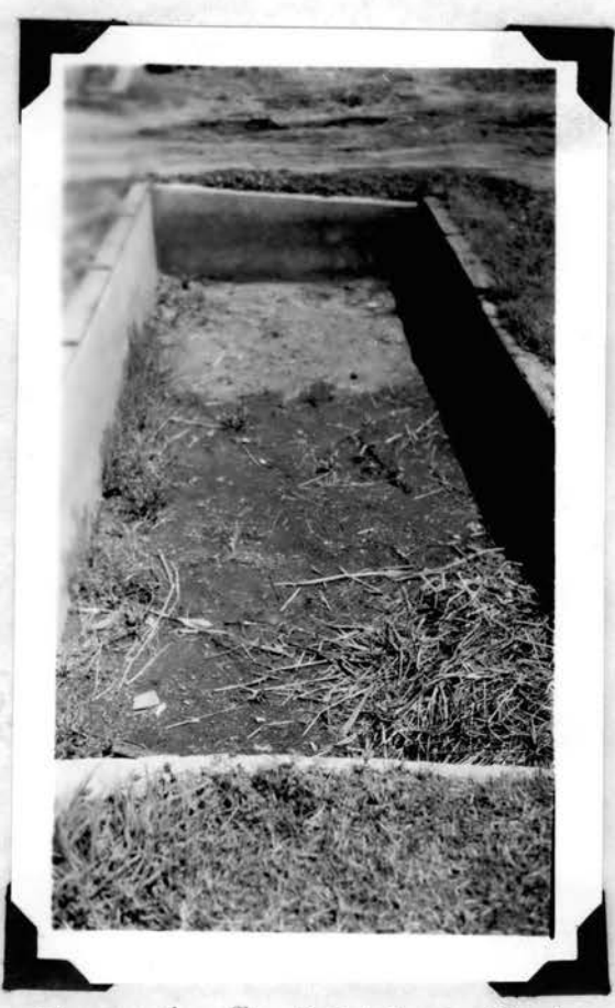
Figure 6. The Cold Frame Used in Pit Composting.