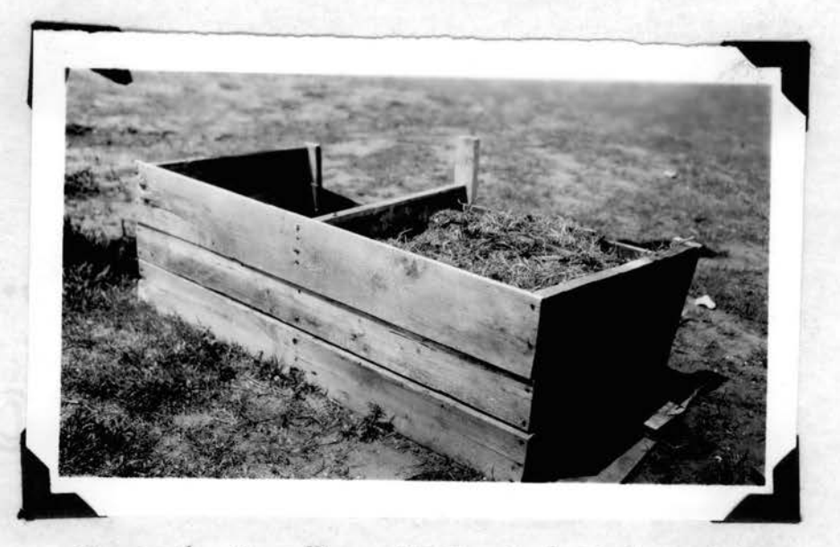
Figure 5. Rear View of A New Zealand Compost Box.