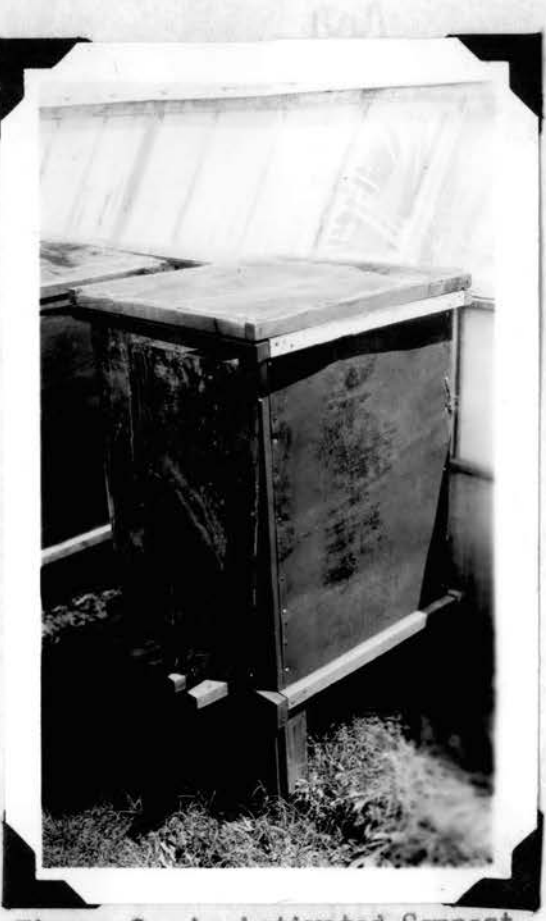
Figure 2. An Activated Compost Frame With Solid Sides in Place.