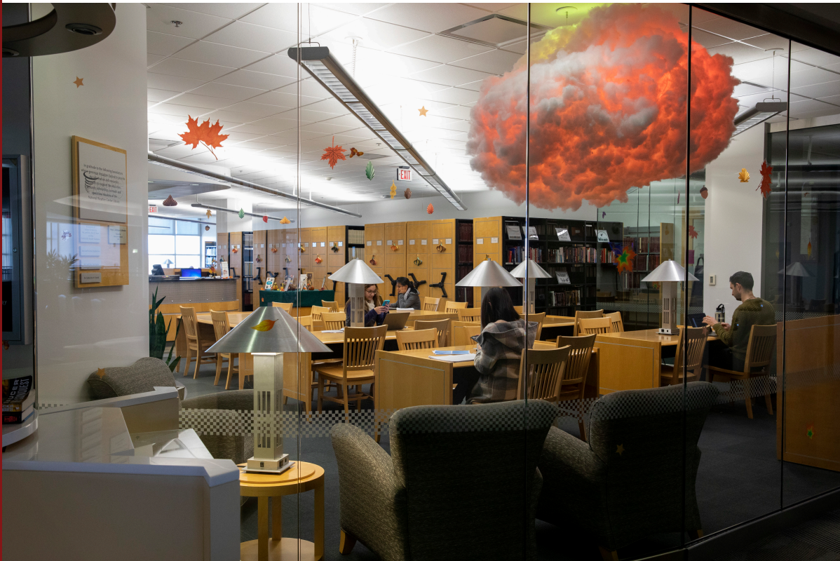
View of the National Weather Center Library