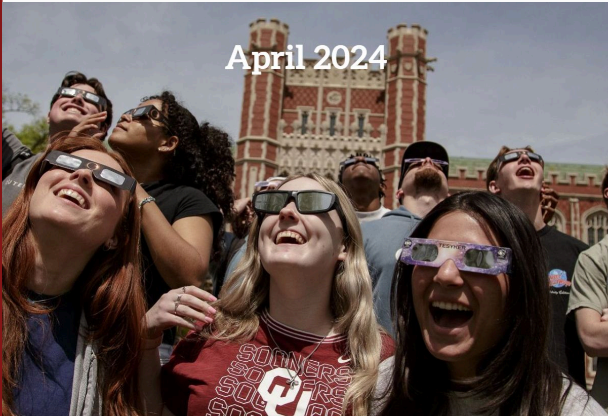
Students watching the April 8 solar eclipse in front of Bizzell Memorial Library.