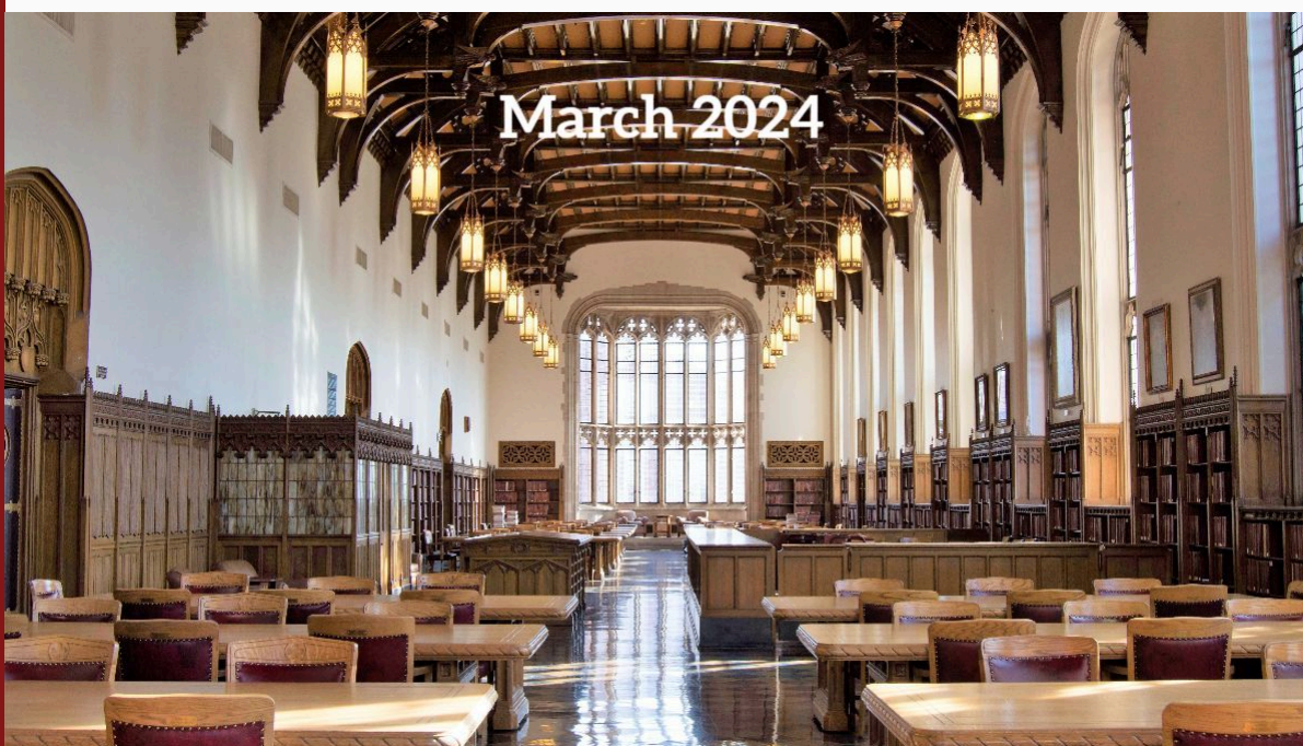
Great Reading Room of Bizzell Memorial Library