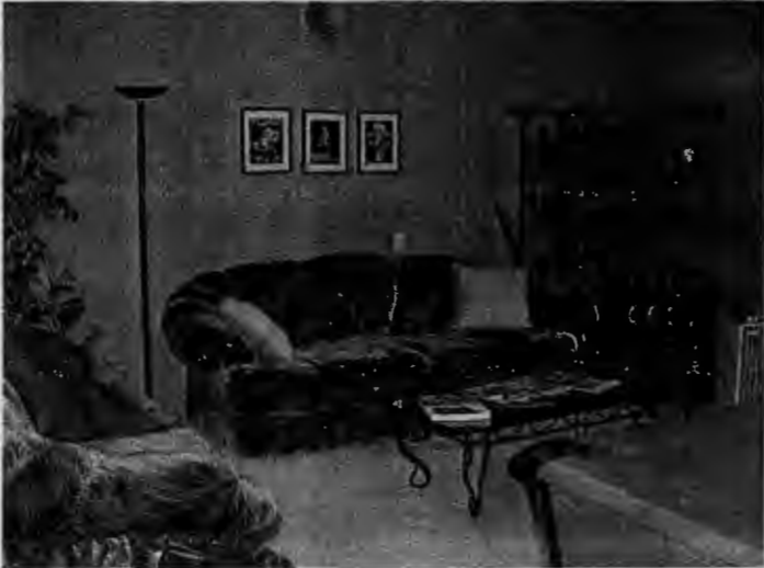
Rest, relaxation or a game of pool all await you in the Recreation Room of the Tulsa GLBT Community Center. Stop by 2114 S Memorial anytime for a visit.

Simply fill out the form on page 11 and you'll be on your way to helping TOHR secure EQUAL rights for you or someone you know.