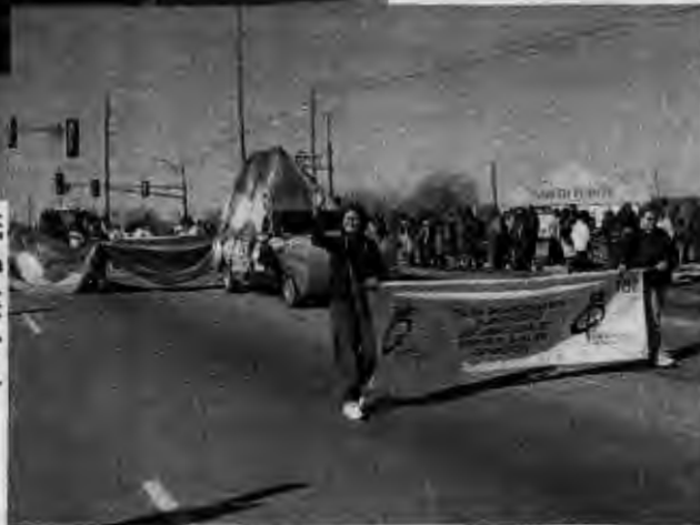
ABOVE: The TOHR float "Visualizing Equality" flows down the street, making a colorful statement of equality. RIGHT: Just crossing the starting line, marchers carry the banner and prepare to unfurl the flag.

And—make plans to take the day off and represent yourself at next year's MLK Parade.