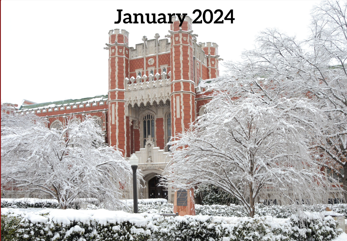
View of Bizzell Memorial Library's south entrance in the snow.