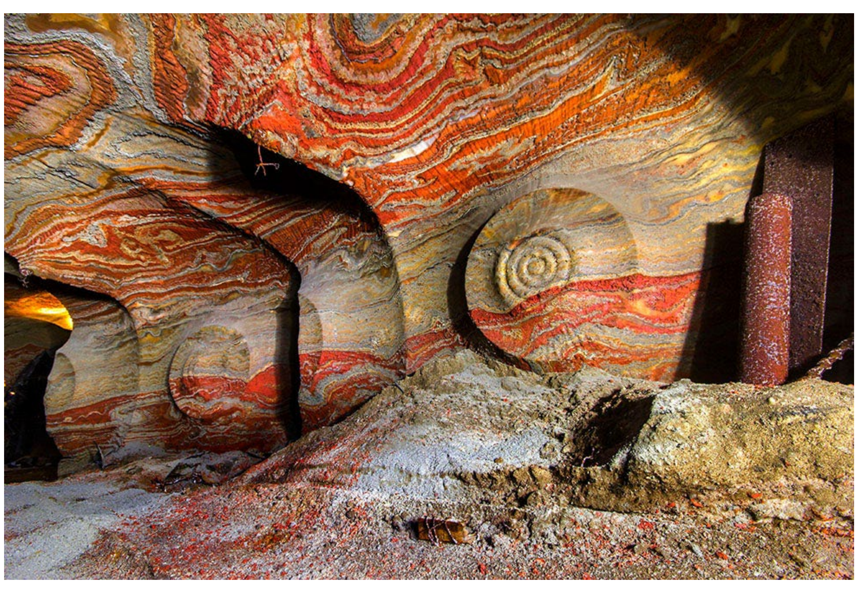
Figure 1: Salt mine

The Weather Channel. Retrieved January 25, 2022, from https://weather.com/science/nature/news/yekaterinburg-russia salt-mines-mikhail-mishainik-20140614