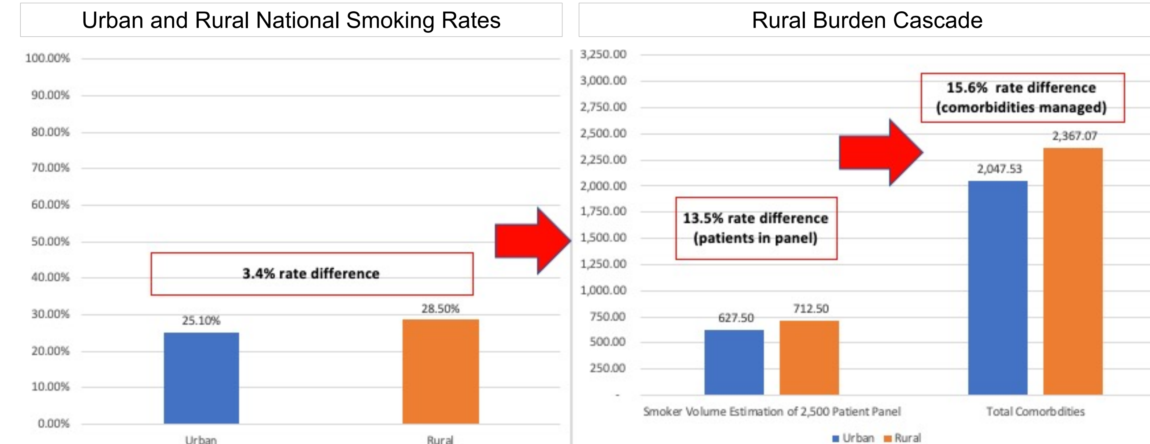
Figure 3. Rural Burden Cascade. In an estimation of a 2500 patient panel, rural smoker care burden grows by the compounding factors of more smokers in a panel who have higher rates of comorbidities.

Using 2500 patients in a patient panel, we estimate that rural primary care physicians care for 85 more smokers than urban counterparts. Due to higher comorbidity rates of those smokers, it is estimated that rural primary care physicians manage 319.54 more comorbidities (2,367.07 rural smoker comorbidities, 2,047.53 urban smoker comorbidities), constituting a 15.6% (319.54/2047.53) comorbidity management workload increase associated with caring for smokers.