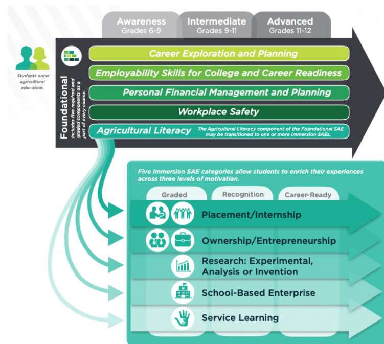
SAE For All Student Roadmap

Note. Reprinted from SAE for All Teacher Handbook (SAE for All, 2023)