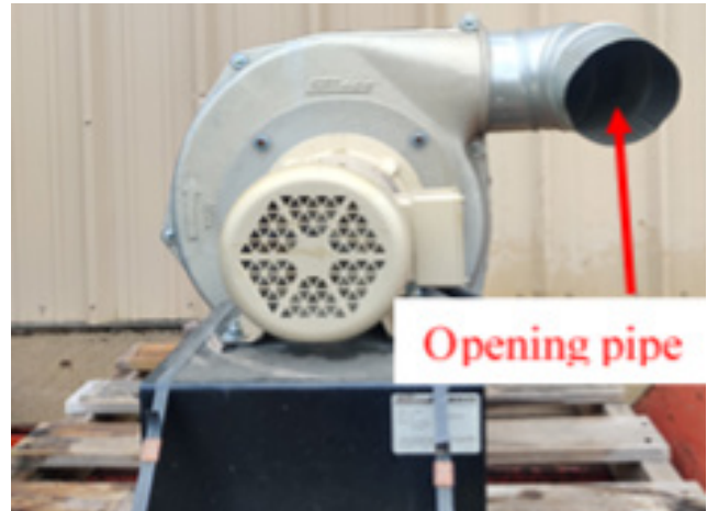
Figure 5: Fan used to increase air flow.

between the fan and two barrels by a three-way system (See Figure 6). Use the duct tape to keep pipe in a position without moving. Maintain at least 10 feet distance between the two barrels for safety and easy of handling.