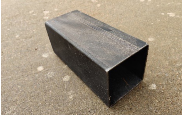
Figure 7: Metal box used as a stand for the small barrel (18 cm X 7.5 cm X 7.5 cm).