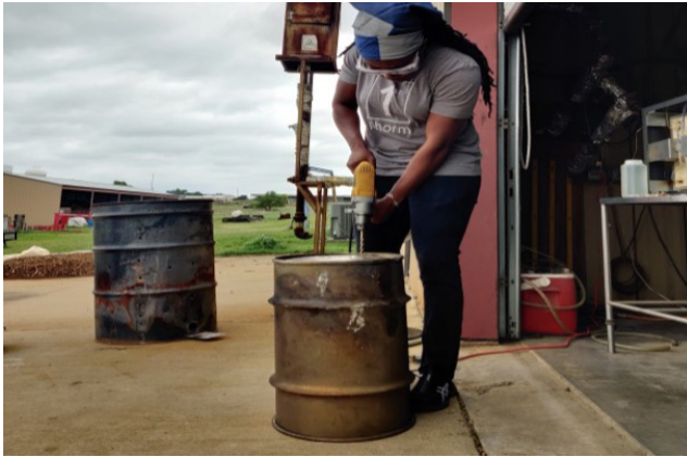
Figure 3: Drilling a hole in the lid for thermocouple.