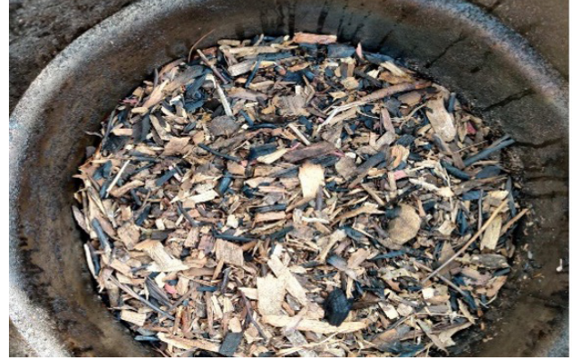
Figure 8: Partially converted biomass.