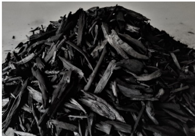
Figure 2: Eastern red cedar mulch biochar prepared from double barrel system.