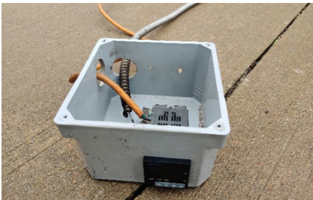
Figure 4: PID connection.