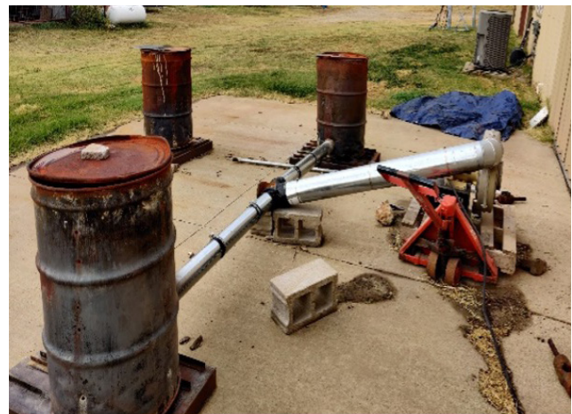
Figure 6: Biochar production on two double barrel system or single barrel in background.