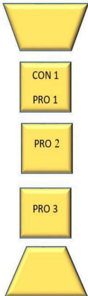
Organization Template 1