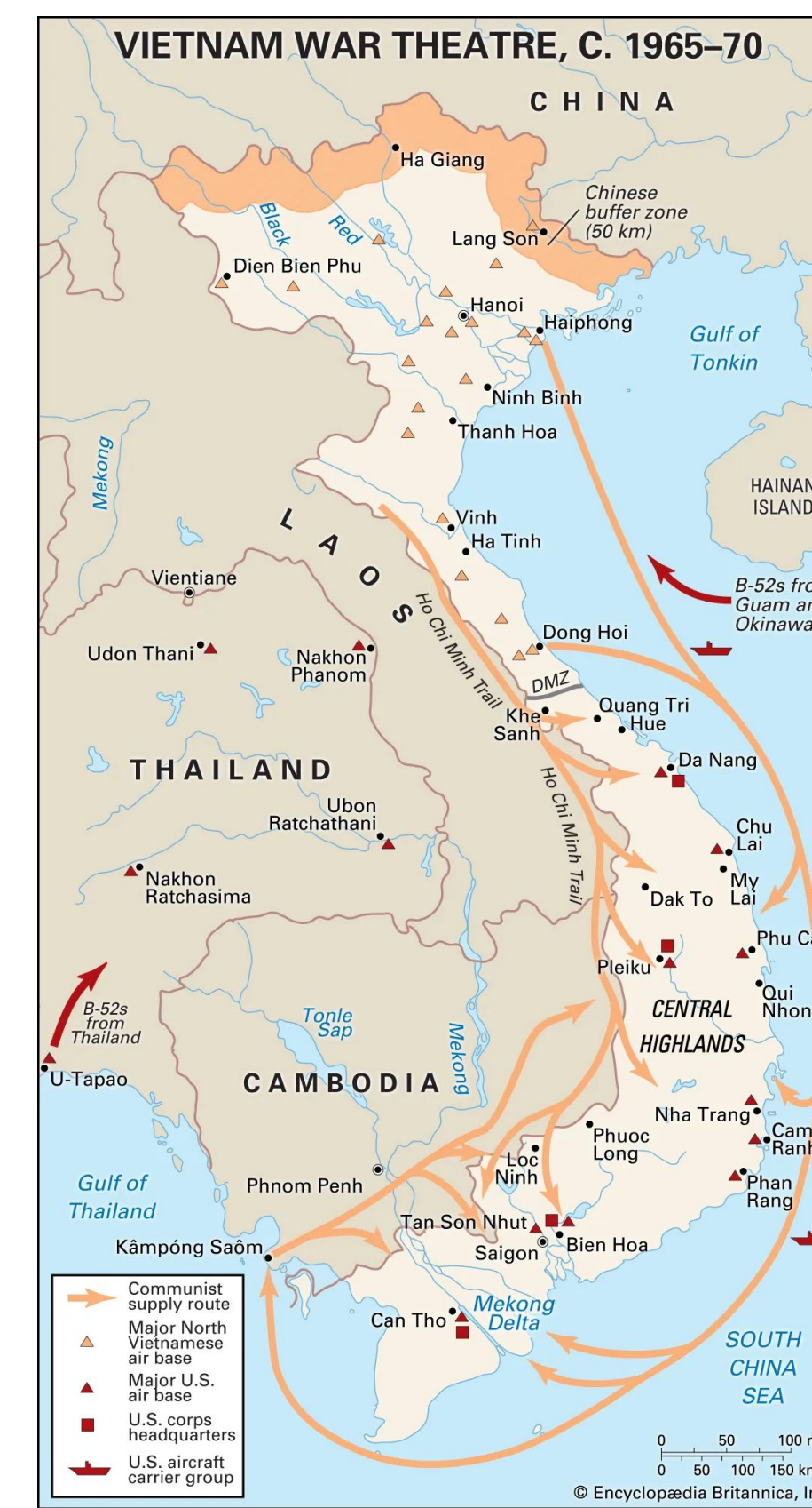
Figure 2 (above): Map of Vietnam Theater