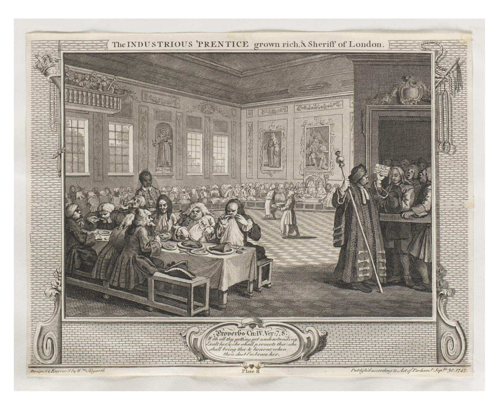
Image 1: William Hogarth's, The Industrious 'Prentice Grown Rich and Sheriff of London . London, 1747.