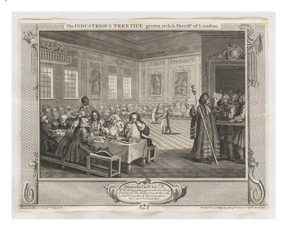
Image 1: William Hogarth's, The Industrious 'Prentice Grown Rich and Sheriff of London . London, 1747.