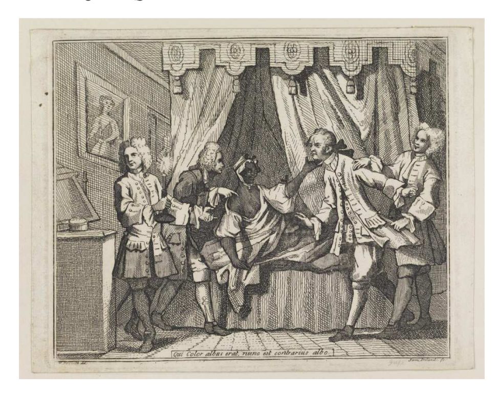
Image 2: William Hogarth's, Qui Color Albus Erat, Nunc Est Contrarius Albo. London, 1743.

In this next image, Hogarth titles his etching with the Latin quote, "Qui color albus erat nunc est contrarius albo" which roughly translates to "Which color was white now is the opposite of white." While this image was found in the Lewis Walpole Library database, The Royal Collection Trust site actually provides more context for the image. The site states that the quote is a line from Ovid's "The Metamorphosis" in which a raven has been turned black as punishment for telling Apollo about Coronis' infidelity, leading him to kill her. In Hogarth's etching, actor, John Highmore, finds a "Black woman in his bed rather than the mistress he expects" (RCT.uk). With the context of the image in mind, a few different interpretations can be made of the drawing and what it says about race, sexuality, and consuming sexuality.