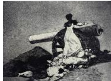
What Courage! 1810-1814

After Napoleon's invasion of Spain in 1808, Goya began a series of etchings entitled The Disasters of War (1810-1814). The series depicts the brutality, slaughter and misery of the Spanish War of Independence. What Courage! represents one of the etchings in this series.