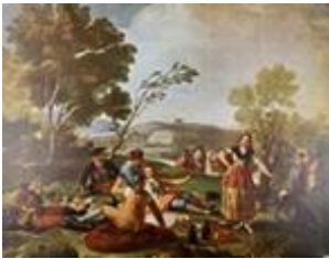
The Picnic, 1776