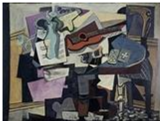
Still Life, 1918