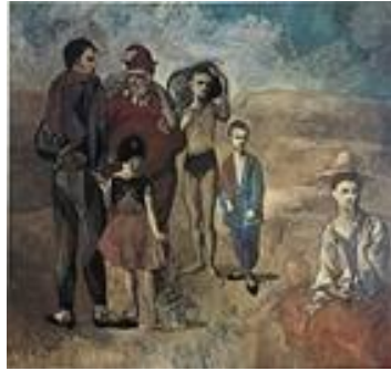
Family of Saltimbanques, 1905

Picasso's life as a young, unknown avant-garde artist living in poverty in Paris between 1900 and 1904 coincides with his Blue Period . Woman Ironing was completed during this time. Shortly thereafter, Picasso's palette of pinks, reds, and grey featured circus players as seen in Family of Saltimbanques .