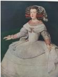
Infanta Maria Theresa, 1653