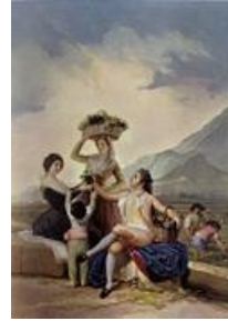
The Grape Harvest, 1786