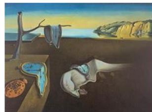
Persistence of Memory, 1931

Salvador Dali was born in Figuera, Spain in 1904. Dali's parents noticed his sophisticated drawing at an early age and strongly supported his artistic talent. In 1916 his mother and father sent him to drawing school at the Colegio de Hermanos Maristas and the Instituto in Figueres, Spain. The following year, Dali's parents built him an art studio at