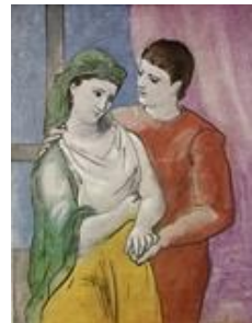
The Lovers, 1923