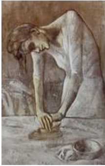
Woman Ironing, 1904

Pablo Picasso was born in 1881 in Malaga, Spain but spent most of his life in France. His father was an art teacher, and by the age of 14 Picasso was an accomplished draftsman.