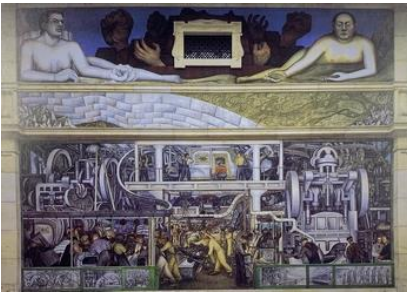
Detroit Industry, South Wall, 1932-33

Diego Rivera was born in Guanajuato, Mexico in 1886. Rivera grew up in Mexico City where he attended the San Carlos Academy of Fine Arts and worked with a leading printmaker of the period, José Guadalupe Posada. When Rivera was twenty years old, he was awarded scholarships from the Mexican government and began traveling to Europe. Rivera's first stop was Madrid where he familiarized himself with Spanish masters El Greco, Francisco Goya, and Diego Velazquez. While in Paris, Rivera was influenced by Picasso. When in Italy, Rivera studied Renaissance frescos and murals which became inspiration for his future works.