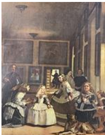
Ladies in Waiting, 1656

Diego Rodríguez de Silva y Velázquez was born in Seville, Spain in 1599. At an early age Velazquez began studying with painters, first with Francisco de Herrera and then as an apprentice to Francisco Pacheco. By the time Velazquez was 20 years old, he had established himself as a fine painter in Seville. His early works depicted genre scenes, images of everyday life, as seen in The Water Carrier .