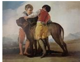
Boys with Mastiffs, 1786