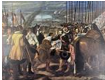
The Surrender of Breda, c. 1653

In 1623, Velazquez was commissioned to paint a portrait of Phillip IV. Having pleased the king, Velazquez was ordered to move to Madrid where he became the leading artist of the King's court. For nearly forty years, Velazquez remained in Madrid painting portraits of the monarch and the royal family. His painting of Infanta Maria Theresa was probably one of three portraits of the daughter of King Philip sent to potential suitors and who would later marry Louis XIV of France. In his spare time, Velazquez turned to subjects outside of the Spanish royal family as seen in The Needlewoman .