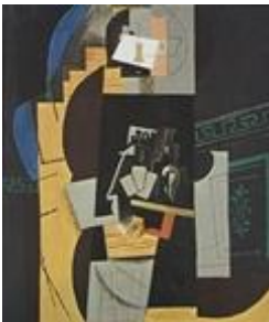
Card Player, 1913-1914

Card Player and Still Life are examples of the style of art for which Picasso is most recognized, Cubism. The subjects in each work are represented by simple shapes and flat planes of color. In 1907 Picasso painted what is regarded as his first Cubist masterpiece, Les Femmes d'Alger (O. J. Version O) . Picasso's subsequent work asserted the enduring value of Cubist art and celebrated the contemporary developments of another movement in which he was involved, Surrealism.