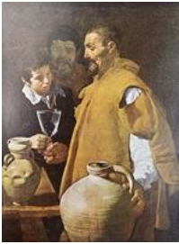
The Water Carrier, c. 1618-1622