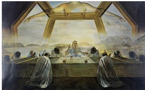
Sacrament of the Last Supper (1955)

In 1922 Dali enrolled in the Academia de San Fernando in Madrid, Spain where he studied Valezquez and the avant-garde art movement Dada. Dali was suspended from the Academy in 1923 and expelled in 1926 for criticizing his teachers. Between 1926 and 1929, Dali traveled to Paris where he interacted with other radical artists including Pablo Picasso, Rene Magritte, and Joan Miro who influenced his shift to Surrealism. One of Dali's most famous paintings and best-known Surrealist works is The Persistence of Memory .