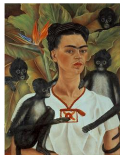
Self Portrait with Monkeys , 1943

Frida Kahlo was born in Mexico City in 1907. Her birth name was Magdalena Carmen Frida Calderon. Kahlo suffered from polio as a child and was nearly killed in a bus accident as a teenager that caused multiple fractures of her spine, ribs, and pelvis. While recovering