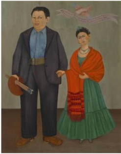
Frida and Diego Rivera, 1931