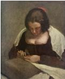
The Needle Woman, c. 1643