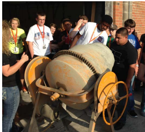
Mixing Concrete, 2015