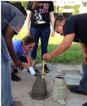
Students perform a slump test, 2015

Architectural Engineering design is introduced through a balsawood truss design project, which has mathematical parameters and connection constraints, and is subject to load testing in the Structural Stress Analyzer unit. The Construction Management exercise furthers this study with the measuring, mixing and pouring of concrete into slumps that are tested 3 days later with a load testing machine. The slump cones are analyzed based upon weight of the concrete vs load carried, illustrating the fundamental concept of engineering economy in project design.