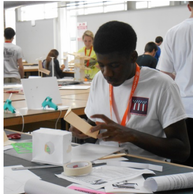
Participants hard at work on their design projects, 2014