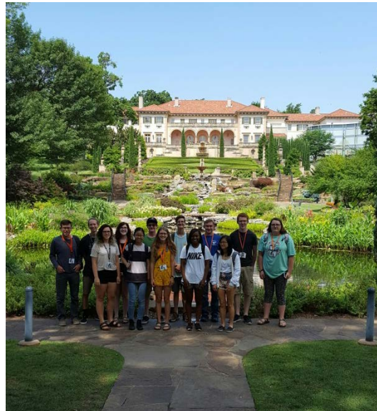
Field trip to a local museum and formal garden, 2016

While there are more than a hundred career exploration academies focused upon architecture offered across the nation annually 5 , few, if any incorporate the STEM disciplines of engineering