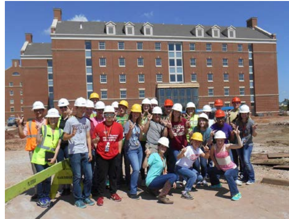
Construction site tour on campus, 2015

The Discover Architecture program upholds the Land Grant mission of OSU through instruction, and outreach to the high school community. Additionally, the program is a model of industry and academia working together - annually eight to ten professional design firms from the state sponsor the program, and their employees interact with the students and faculty. The workshop is a unique interdisciplinary educational opportunity utilizing the framework of the building arts, and makes it available in an economic manner to the next generation of college students from across the state and nation.