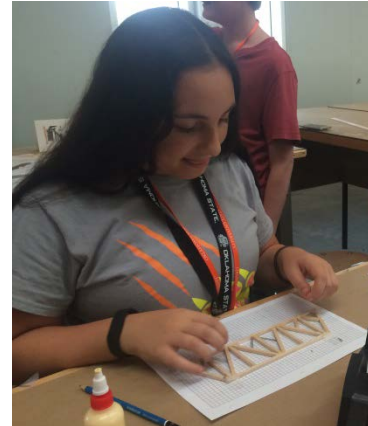
Building a truss, 2014

The professional world of building design and construction is showcased through lunchtime mentoring sessions with professionals at varying levels of their careers, and through interactions with current university students serving as teaching assistants and residential assistants. A guided tour of a working construction site on campus allows all of the disciplines necessary to complete a work of architecture to be illustrated as an organic, interdisciplinary whole. Finally, a tour of a professional firm caps the week long experience, where students visualize the office environment and see professional architects and engineers at work on actual projects.