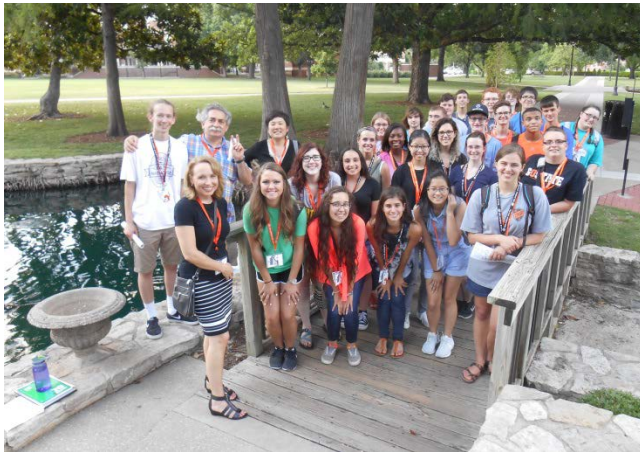
Group picture on an evening campus walk, 2016

The Discover Architecture workshop is a week long career orientation summer program for high school students that the School of Architecture has offered from 2002-2005 and 2009-2016. Since 2013, the faculty of this program expanded the academic content of the workshop to include the allied disciplines of Landscape Architecture and Construction Management. This has provided a more full exploration of the various professions involved in the building arts, and has helped us achieve a broader freshman recruitment for the university.