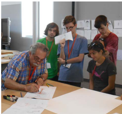
Drawing workshop with the professor, 2016

The workshop curriculum consists of sessions focused upon sketching, general problem solving, engineering design, environmental design, a construction activity, and computer applications. A construction site on campus offers the ability to see firsthand what it takes to bring architecture into being. Participants interact with university faculty and current students pursuing these disciplines, as they complete hands-on learning activities. As a special feature, participants enjoy a field trip to the major urban center in the state to tour a noteworthy work of architecture and visit a professional firm. The conclusion of the workshop is a public show of student work; parents are invited to learn about what their student has accomplished in the program.