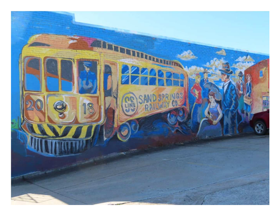
Pictured is Mural along S. Adams Road, Sand Springs, Oklahoma, depicting the Sand Springs Railway Company incorporated soon after the establishment of the city. The railroad dreamscape and pictorial imagery strikes the observer as a prominent figure of the town's history, yet today, the railroad lies largely empty and underutilized.

men over the age of 18 are not allowed overnight.<sup>51</sup> The widow's colony and orphanage are still in operation today and maintain many of the stringent rules authored by Page over a century ago. The Sand Springs Home and colony occupies a large swath of land at the corner of Adams Road and Charles Page Boulevard, where "Adams" is the only reminder of the allotment that predates Page's construction of the orphanage. Assessing the intent of historical dispossession like this is difficult, but much remains as to why the allotments that once occupied this area get little mention in the Home's own historical description, on its website and publicly, or why the Adams family had to be cleared for the home to operate initially. Walking along the Sand Springs downtown area, monuments to Page speckle the walls of every corner. Every facet of Sand Springs social life is in some way an homage to Page.