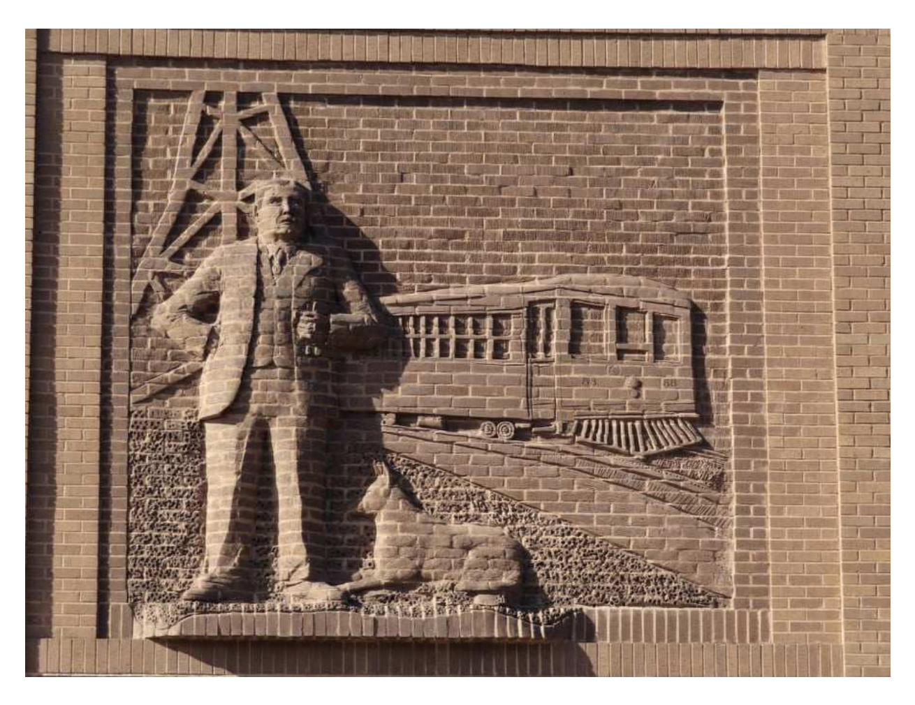
Charles Page Monument adorning the side of a downtown building in Sand Springs near 2nd and Main St. At the foot of Page sits a loyal dog, and behind him a large oil derrick and railway car jut out from the brick siding. The art unmistakably focuses rugged individualism with Page as the soaring example.

This is generally the "meta-story" of Sand Springs. Growing up here, I never thought much of the origin of Sand Springs other than what I could physically see going to school every day. Charles Page High School sits right across the street from the orphanage and widow's colony, with Page's name plastered all over the downtown area. Murals and statues of Page adorn the brick and art-deco buildings of the surrounding town, usually depicted with children to his side. Those who have read a bit more about Page's business practices likely remember less about his ties to the orphanage, and more regarding his deep attachment to the capital, wealth, and accumulation of land. The story of Charles Page is an unabashed microcosm of Oklahoma's Progressive Era, defined by oil wealth and the accumulation of land and resources at the expense