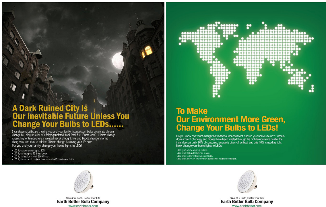
Figure 2. Example Stimuli Used in the Experiment

This variable indicates the extent of subjects’ belief that they can personally prevent global climate change. To measure this variable, three items are used: “I will take steps to participate in behaviors that help prevent global climate change, even if it causes inconveniences,” “I can