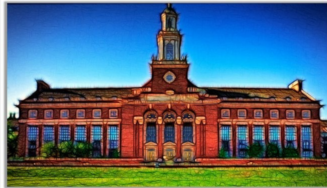
"Edmon Low Library at Oklahoma State HDR"