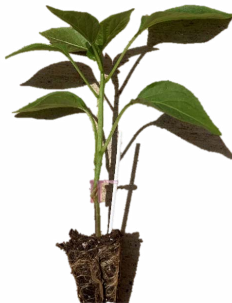
Figure 1. Grafted pepper using the splice method. The union is secured by a grafting clip.

This type of graft may also be called approach grafting. To begin, cut a forty-five-degree downward angle slit about half-way through the rootstock stem below the cotyledons. Make an upward angled slit in the scion at the same height as the rootstock. Bring the stems together so they overlap making