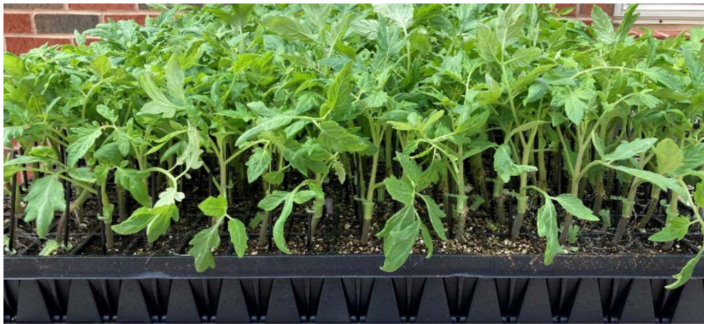
Figure 6. Grafted tomatoes completely healed and ready for transplanting to the field.