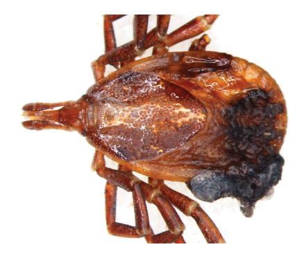
FIGURE 1 . Dorsal view of adult A. longirostre female found in Oklahoma, note the elongated scutum.

On 24 September 2005, a homeowner discovered a large, odd looking tick crawling on a propane tank in Pittsburg County, south of Hartshorne, Oklahoma. The tick was collected, brought to the Pittsburg County Oklahoma Cooperative Extension Service office where it was sent by mail to the Plant Disease and Insect Diagnostic Lab (PDIDL) in the Department of Entomology and Plant Pathology at Oklahoma State University. The tick was identified on 3 October 2005 using an established key (Jones et al. 1972) (Figs 1, 2) as an adult female A. longirostre and given an ascension number (#200501316). It was later verified using detailed descriptions by Voltzit (2007).