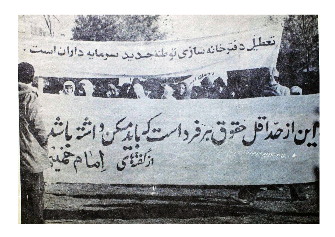
Figure 5: "Every person should have a house. It is a minimum right of every person." (Imam Khomeini)

(Jame'eh va Memari 1980, National Library and Archives of the Islamic Republic of Iran)