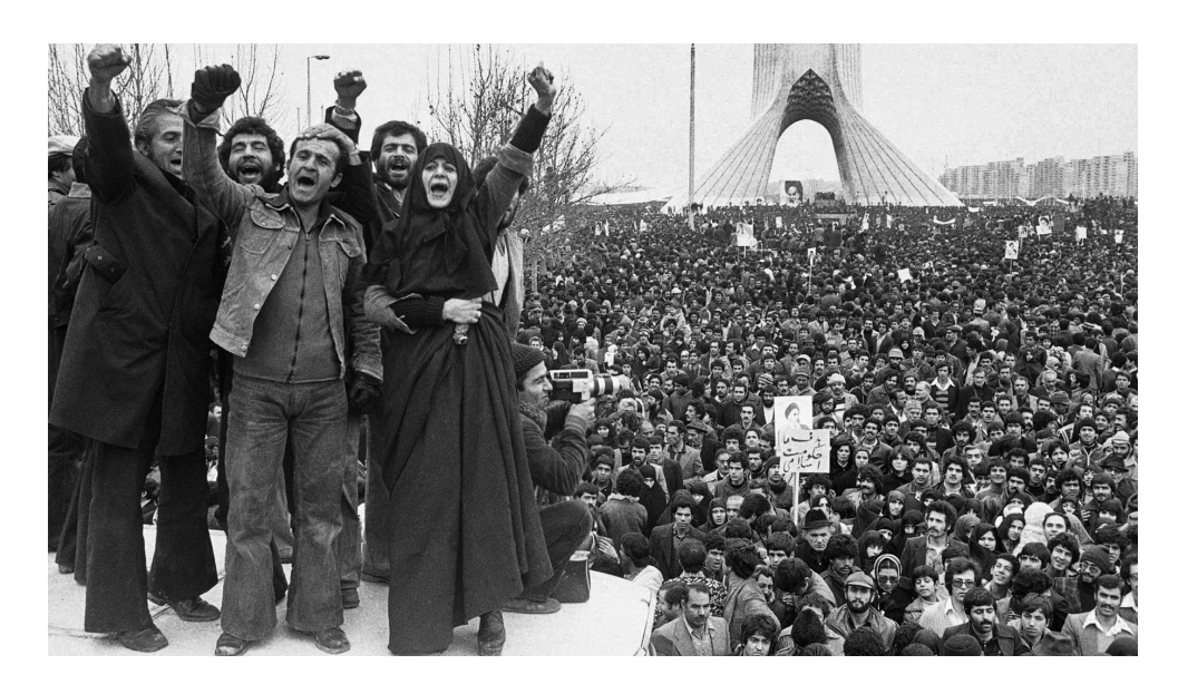
Figure 6: "No East, No West, Just Islamic Republic" (Jame'eh va Memari 1980, National Library and Archives of the Islamic Republic of Iran)

(Jame'eh va Memari 1980, National Library and Archives of the Islamic Republic of Iran)