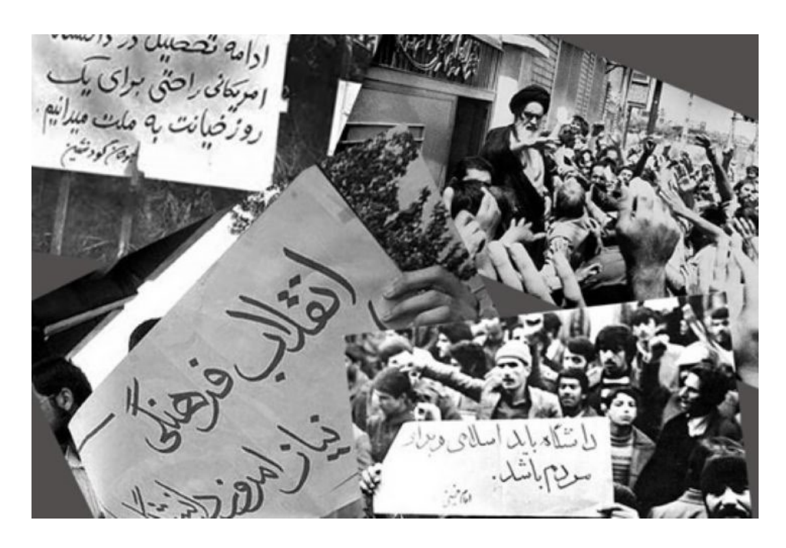
Figure 4: Some slogans from the Iranian Cultural Revolution: from left to right, "Studying at the American University even for one day is a betrayal of the nation"; "Today, the university needs a Cultural Revolution"; "The university should be Islamic and for the people."

(Jame'eh va Memari 1980, National Library and Archives of the Islamic Republic of Iran)