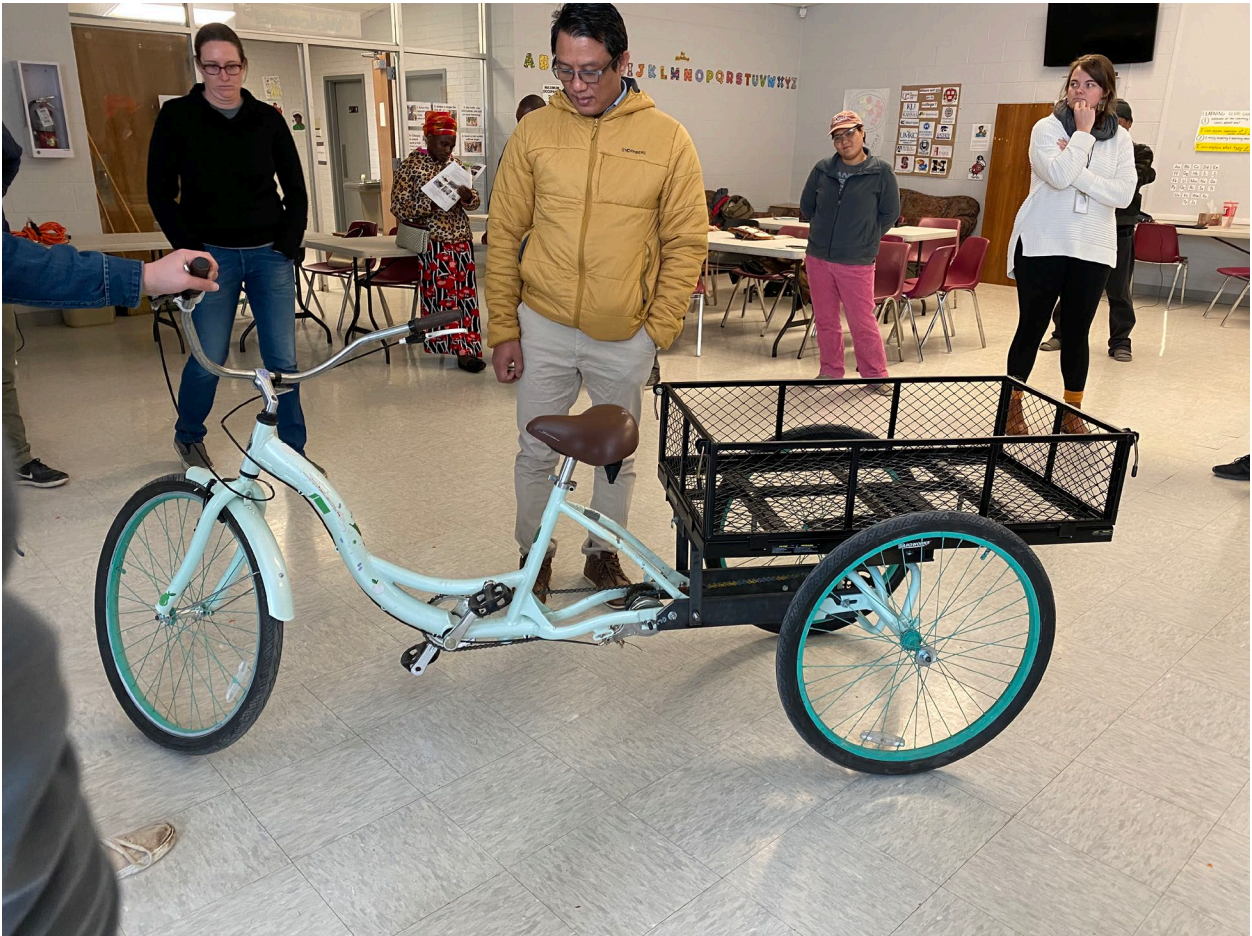
Figure 5: Sharing a bike-based farm utility vehicle prototype with potential users in the New Roots for Refugees program in Kansas City. The bike was developed in a seminar with KU architecture students and KU industrial design students.

Through this experience, students gained the capabilities to learn how to use their abilities to research different models of urban agriculture and enable them to be better listeners and apply their knowledge directly to a design experience. In preparation for the design charrette, we developed a toolkit that included a scaled physical model, program template parts, and other elements (like a board game) to make all participants designers, ready to bring their expertise to the conversation. The students were able to support the effort by listening, restating, and taking notes, ultimately bringing the ideas together in a presentation to all that participated. By engaging with others, they were able to test and apply learned design skills in another way—enabling design agency for others (Figure 5).