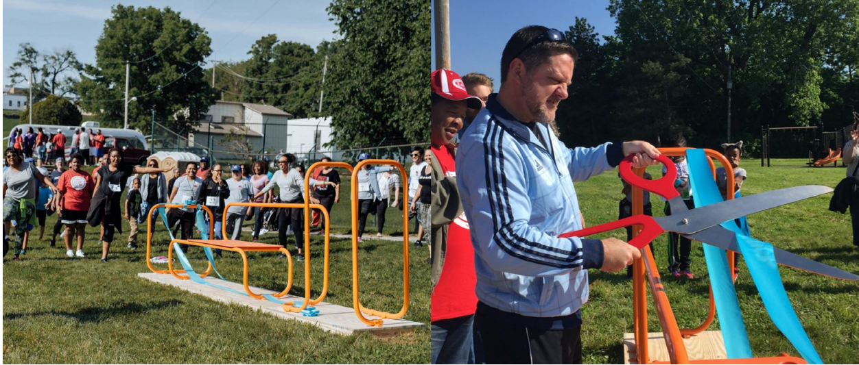
Figure 3: Mayor Mark Holland cutting the ribbon on exercise station prototypes designed and constructed in a third-year design studio course (Dotte Agency)

legitimize this work in an academic way that institutionally favors individual achievement (achieving promotion and tenure for this work is evolving in universities)—none of which is easy. However, we have identified four basic ways to work: (1) learn by designing and making; (2) learn by cross-disciplinary engagement; (3) learn by engaging in other fields and cultures; (4) learn by serving in the pipeline.