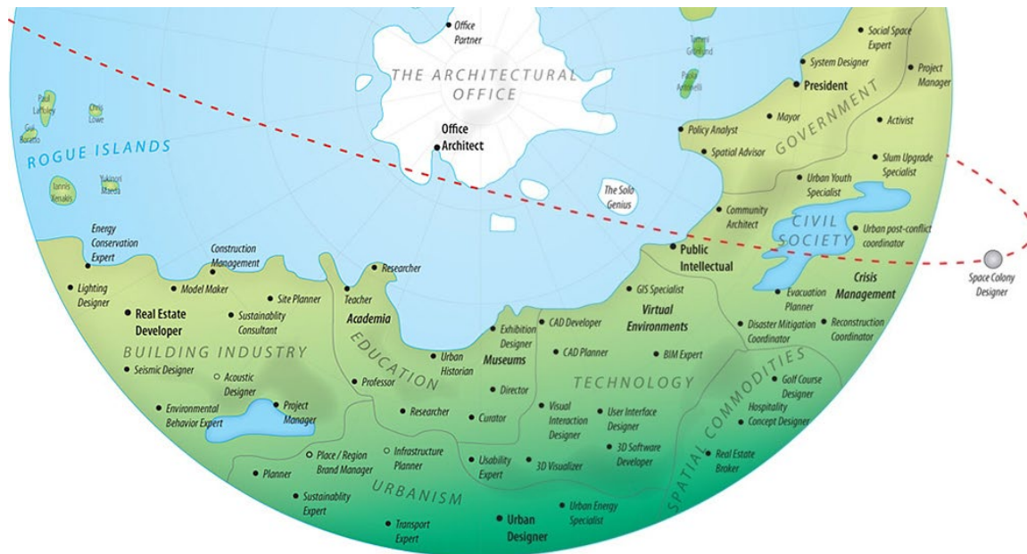
Figure 1: Image from Kalliala and Park, “New Architect’s Atlas” ( http://helsinki.designlab.org/blog/new-architects-atlas.html CC BY-SA 3.0 license)

specialist consultants, and the shift from architects being in the service of public to private capital, has made a lot of the work and responsibilities that traditionally belonged to them simply disappear or move to other professional domains. This is why newly graduated architects have difficulties finding jobs that match their education, creative ability or ambition—not to mention the thousands of students facing an increasingly uncertain future” (Kalliala and Park 2010; Figure 1).