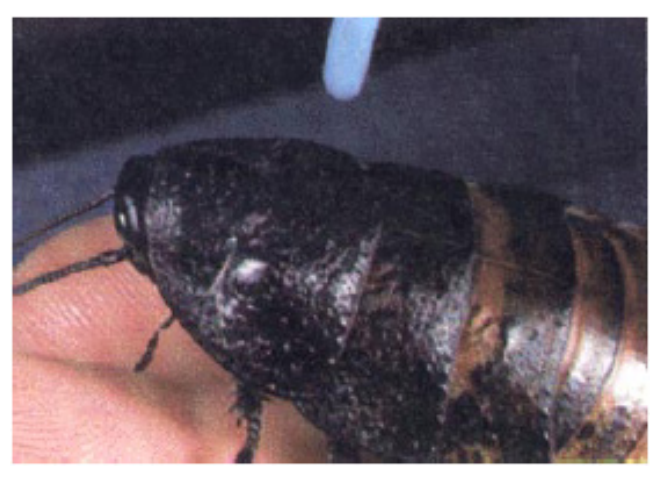
Figure 2. Female Madagascar Hissing Cockroach.

The MHC is relatively easy to care for and makes an excellent pet. Owners should maintain their pets in an area that provides a dark, moist and secluded environment, free from heavy air movement. Often laboratory colonies are maintained in large, dark trash cans, with cardboard dividers or wire mesh to add extra surface areas for the roaches to climb. Entomologists working with roaches usually keep them in glass or plastic