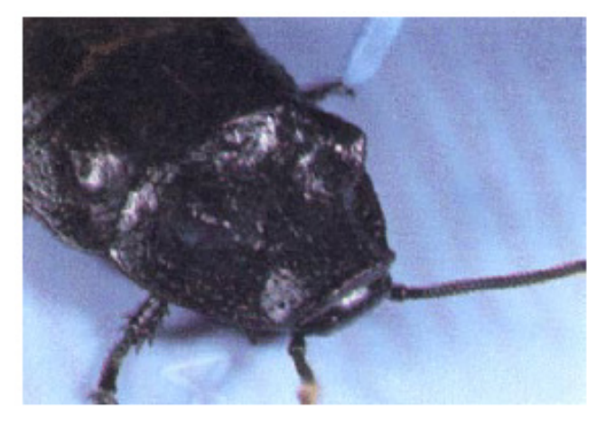
Figure 1. Male Madagascar Hissing Cockroach.

Similar to other cockroaches, the MHC is negatively phototactic (moves away from light) and, therefore, is nocturnal in activity. The MHC is also omnivorous (eats anything), but is strongly attracted to peanut butter, bananas and oranges. When living in colonies, this species exhibits a definite social hierarchy. Males will establish and defend a territory on a rock or other similar structure for several months. He will leave it only for brief periods to obtain food and water. Female MHC are gregarious (form groups) and have not been observed to fight either among themselves or with males. Females and nymphs are allowed on the defended area that may harbor several adult females and an assortment of various-sized nymphs, but only one male. When a male intrudes on a neighboring male's territory, a fight will ensue. One male will attempt to push the other out of his territory. During the battle, a great deal of movement and hissing will occur; however, no harm is done to the loser. Mating behavior of the MHC is elaborate and involves posturing and hissing by the males to attract females.