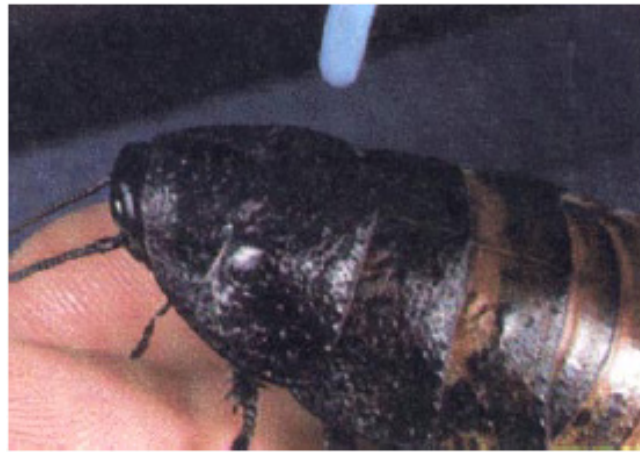
Figure 2. Female Madagascar Hissing Cockroach.

The MHC is relatively easy to care for and makes an excellent pet. Owners should maintain their pets in an area that provides a dark, moist and secluded environment, free from heavy air movement. Often laboratory colonies are maintained in large, dark trash cans, with cardboard dividers or wire mesh to add extra surface areas for the roaches to climb. Entomologists working with roaches usually keep them in glass or plastic