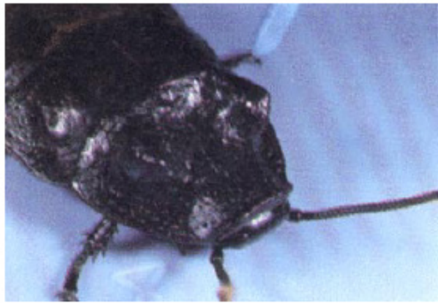
Figure 1. Male Madagascar Hissing Cockroach.

Similar to other cockroaches, the MHC is negatively phototactic (moves away from light) and, therefore, is nocturnal in activity. The MHC is also omnivorous (eats anything), but is strongly attracted to peanut butter, bananas and oranges. When living in colonies, this species exhibits a definite social hierarchy. Males will establish and defend a territory on a rock or other similar structure for several months. He will leave it only for brief periods to obtain food and water. Female MHC are gregarious (form groups) and have not been observed to fight either among themselves or with males. Females and nymphs are allowed on the defended area that may harbor several adult females and an assortment of various-sized nymphs, but only one male. When a male intrudes on a neighboring male's territory, a fight will ensue. One male will attempt to push the other out of his territory. During the battle, a great deal of movement and hissing will occur; however, no harm is done to the loser. Mating behavior of the MHC is elaborate and involves posturing and hissing by the males to attract females.