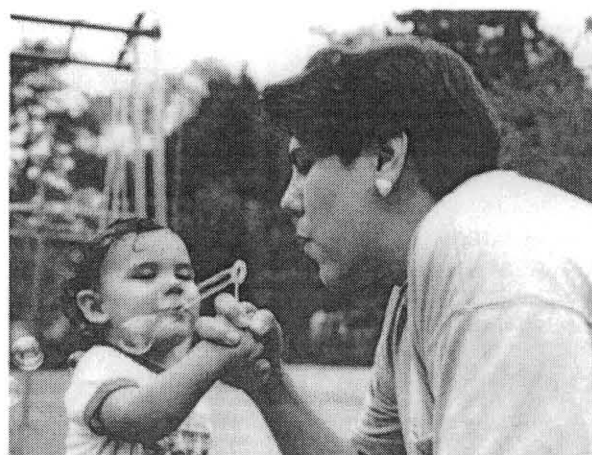
Infants and toddlers can be easily distracted by providing them with an interesting alternative.

Oklahoma Cooperative Extension Fact Sheets are also available on our website at: http://www.osuextra.com