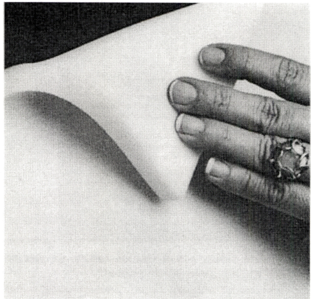
Urethane (Sponge Foam) Carpet Cushion

• Pneumecel. A pneumecel carpet cushion is a pressurized cellular structure chemically composed of a polyester