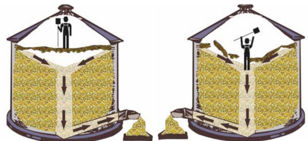
Figure 2. Grain can form a hard crust, which appears to be firm enough to walk on. However, the crust can break and instantly bury an individual in the hollow cavity that formed underneath the bridge.

A grain bridge can form when grain on the surface is moldy or frozen together to form a hard, thick crust. When grain is unloaded from a bin with a surface crust, a hollow cavity forms underneath the grain bridge (Figure 2). If an individual enters the bin and attempts to walk on the crusted surface, the additional weight will cause the crust to collapse and the individual could be partially or completely submerged instantly. The shifting grain can move the victim four to five feet from the point of entry where the victim was last seen, making it difficult to determine exactly where the victim is located.