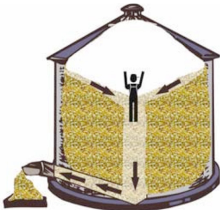
Figure 1. Entrapment can occur quickly while an unloading auger draws grain from the center of the bin, forming a surface cone as the bin is emptied.

During unloading, the grain in a bin flows downward from the top center of the bin, creating a “funnel” effect that draws material and objects down to the conveyor at the bottom of the bin (Figure 1). An unloading auger at the bottom of the bin transports the grain outside. It only takes two to three seconds to become helpless in flowing grain. With the trend toward moving grain faster, entrapment happens much faster than a victim can react. Flowing grain acts like quick sand and can pull a worker under, causing suffocation. This can also happen inside a gravity wagon.