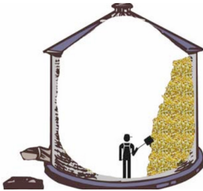
Figure 3. If broken up from below, a steep wall of grain can break free, causing an avalanche that could bury workers inside the bin.

Grain in bad condition can cake in large vertical columns against the bin wall. Workers may try to dislodge the grain by poking it with a stick or shovel (Figure 3). This can cause the grain wall to break free, resulting in an avalanche that can completely bury workers inside the bin. Vibration from trucks outside the bin, running machinery or passing trains can cause the grain wall to release as well.