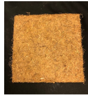
Figure 2. Coconut coir.

Coconut coir is also known by trade names like Ultrapeat®, Cocopeat® and Coco-tek®. It is a completely organic medium made from shredded coconut husks. Different sources and