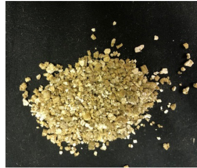
Figure 5. Vermiculite.

It is a micaceous mineral that is heated at temperatures near 2,000 F until it expands into pebbles. It is considered an excellent rooting medium. It is often used in combination with other types of media like coconut coir or peat moss to start seedlings. It is produced in various grades, the most common being 0 to 2 mm, 2 to 4 mm and 4 to 8 mm in diameter.