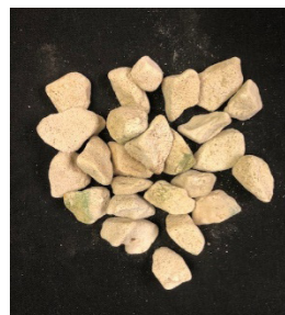
Figure 7. Growstones.

Growstones are made from recycled glass. They are light weight, unevenly shaped, porous and reusable. They have good wicking ability and can wick water up to 4 inches above the water line. It is important to have good drainage to prevent stems from rotting.