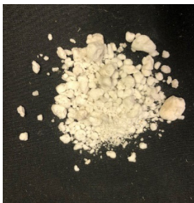
Figure 4. Perlite.