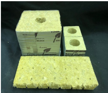
Figure 1. Mineral wool.

Mineral wool (such as Rockwool) is a sterile, porous, non-degradable medium composed primarily of granite and/or limestone, which is superheated and melted, then spun into small threads and formed into blocks, sheets, cubes, slabs or flocking. It readily absorbs water and has decent drainage properties, which is why it is used widely as a starting medium for seeds, rooting medium for cuttings and for large biomass crops like tomatoes.