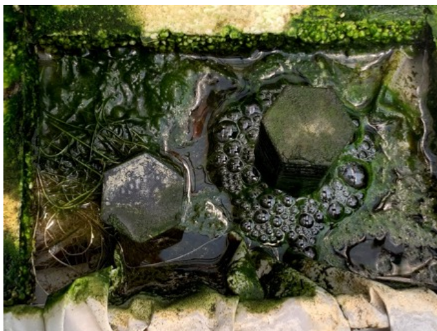
Figure 2. Algae growing in an Ebb and Flow hydroponic system.

In agricultural systems, algae can cause problems in surface ponds, reservoirs, hydroponic and aquaponic systems and irrigation and cooling equipment (Figure 3). Shallow, stagnant water and high levels of nutrients can promote algal growth. This growth can cause clogging of irrigation systems and pumps, as well as competition with crops and attracts pests such as shore flies and fungus gnats.