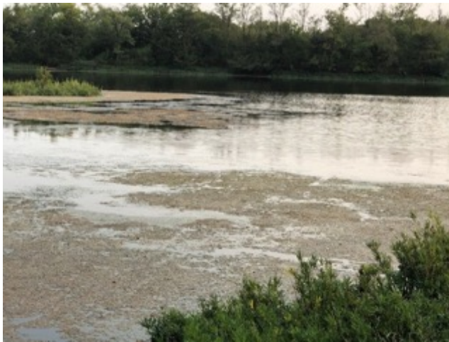
Figure 1. Algae growing in a pond used for irrigation.

Beginning in the 1830s, algae were classified in groups based on color: red, brown, and green. More recently, the group has been divided to seven major types. These groups are Euglenophyta, Chrysophyta, Pyrrophyta, Chlorophyta, Rhodophyta, Paeophyta and Xanthophyta. The divisions are based on distinct sizes, functions and colors. In most ponds and irrigation systems, members of Chlorophyta, Chrysophyta, and cyanobacteria are usually the culprits in clogging pumps or creating mats on the surface of the water (Figure 1).