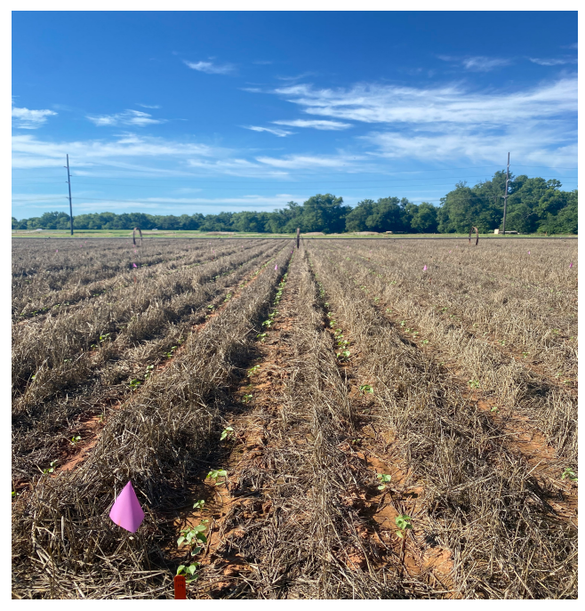
Figure 1. Trial site in Stillwater, three weeks after planting.

The winter wheat cover was planted on at 60 pounds per acre and terminated six weeks prior to planting cotton on June 2, 2020 at 34,200 seed per acre. Preemergence herbicides were applied shortly after planting and were incorporated using overhead irrigation. Due to timely incorporation, all PRE herbicides were effective against target weed species (Palmer amaranth, large crabgrass, carpetweed and ivyleaf morningglory). Herbicide systems are described in Table 1. No stand