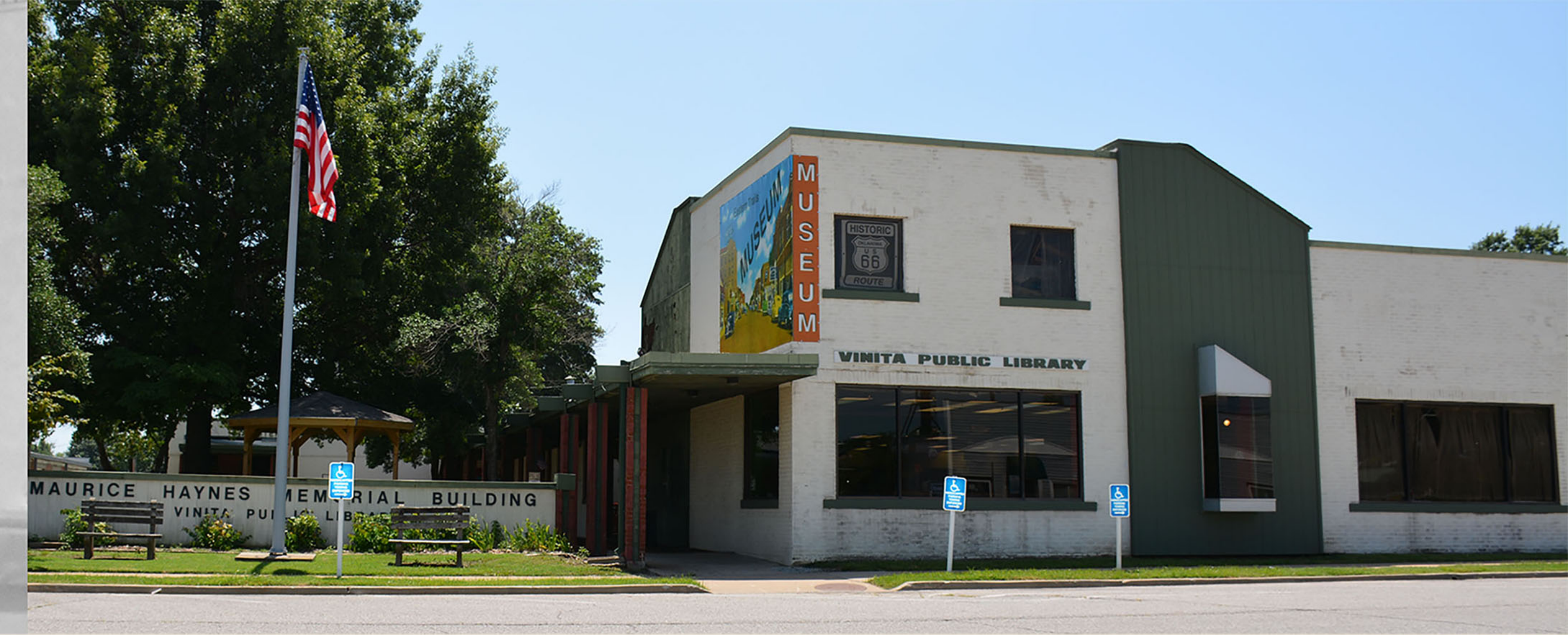
Eastern Trails Museum