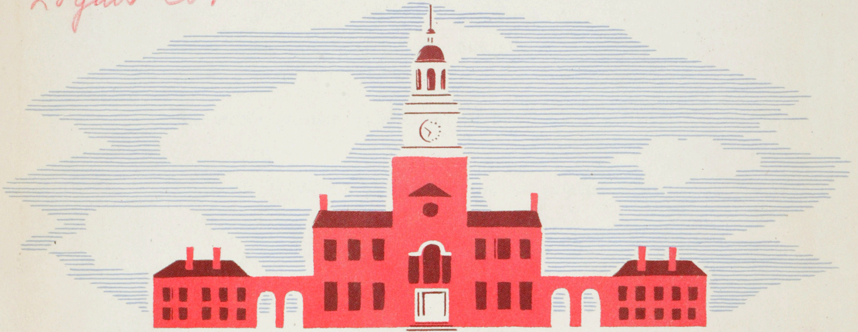
Independence Hall PHILADELPHIA 1776

SPONSORED BY * * THE WAR SAVINGS STAFF OF THE U. S. TREASURY DEPARTMENT, THE U. S. OFFICE OF EDUCATION AND ITS WARTIME COMMISSION