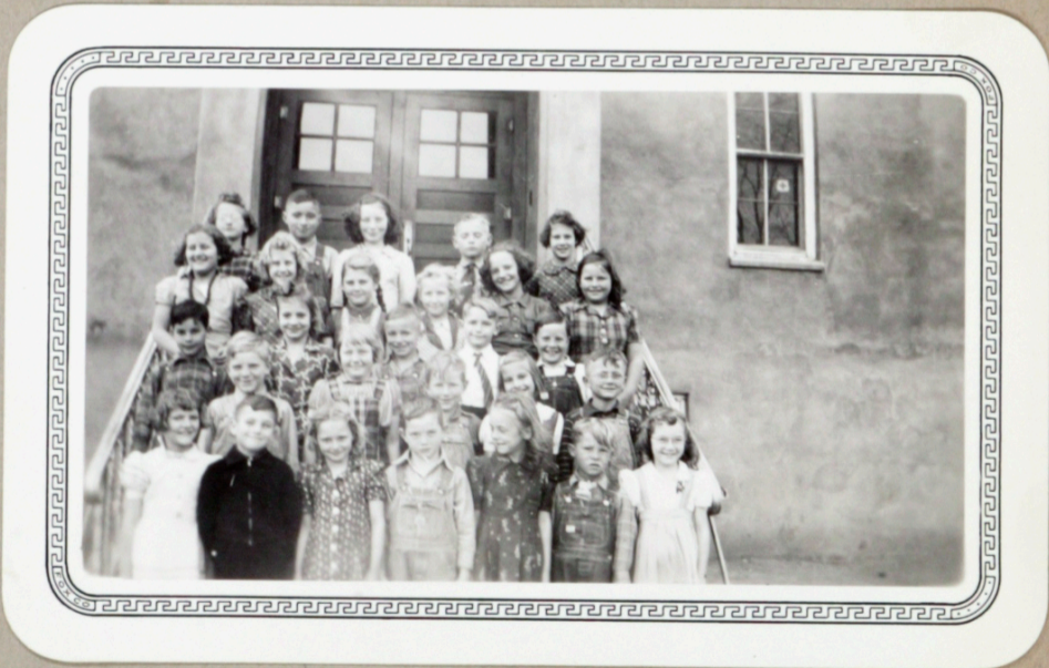
A Number of the Primary and Intermediate Grades