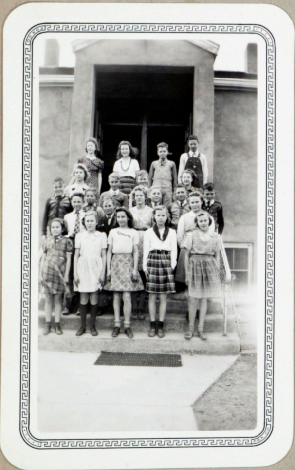
Some pupils from Sixth, Seventh & Eighth Grades