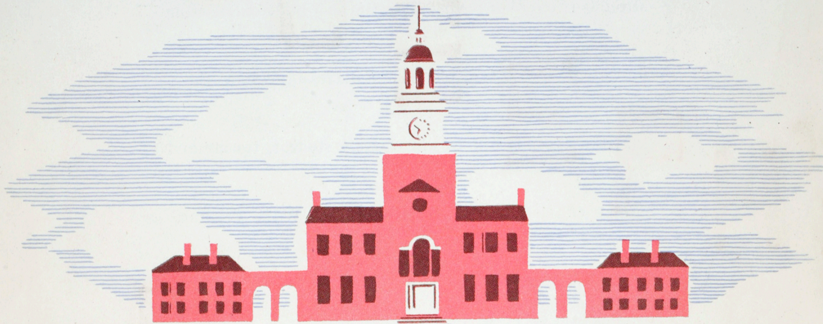
Independence Hall PHILADELPHIA 1776

SPONSORED BY • • THE WAR SAVINGS STAFF OF THE U. S. TREASURY DEPARTMENT, THE U. S. OFFICE OF EDUCATION AND ITS WARTIME COMMISSION