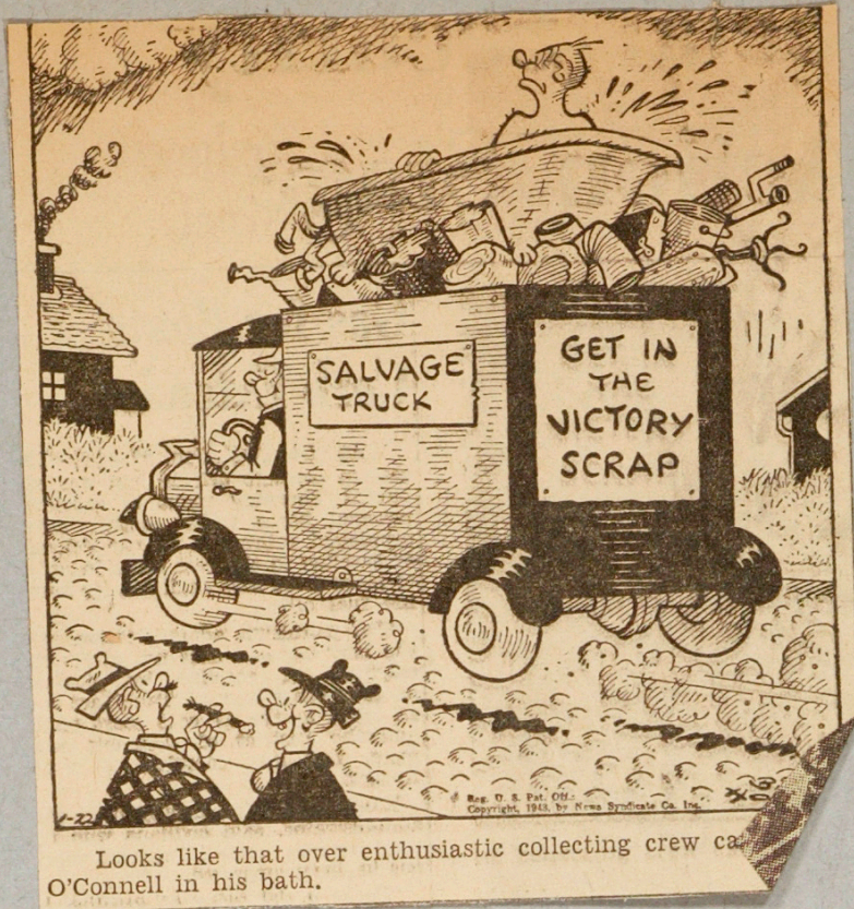
Looks like that over enthusiastic collecting crew called O'Connell in his bath.