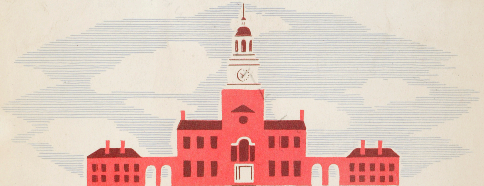
Independence Hall PHILADELPHIA 1776

SPONSORED BY * * THE WAR SAVINGS STAFF OF THE U. S. TREASURY DEPARTMENT, THE U. S. OFFICE OF EDUCATION AND ITS WARTIME COMMISSION