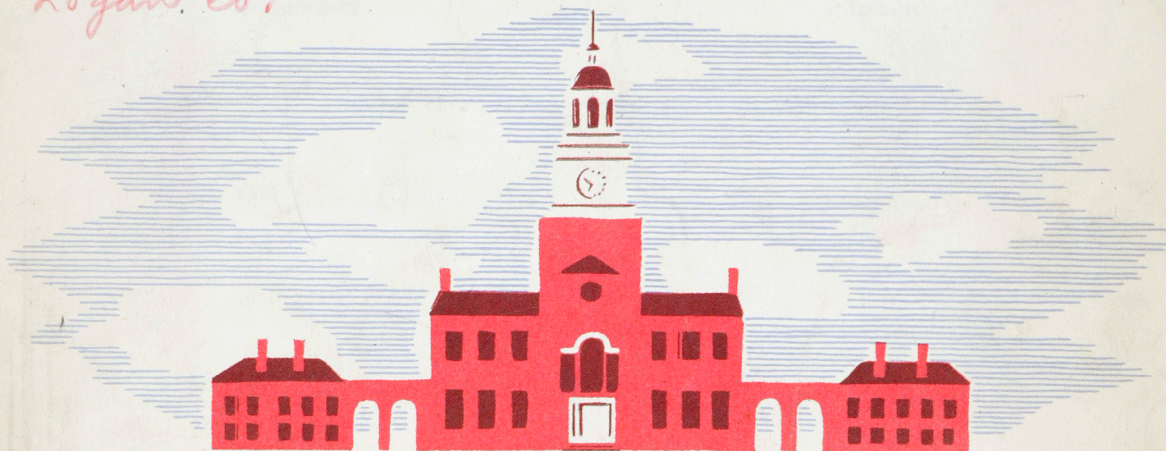
Independence Hall PHILADELPHIA 1776

SPONSORED BY * * THE WAR SAVINGS STAFF OF THE U. S. TREASURY DEPARTMENT, THE U. S. OFFICE OF EDUCATION AND ITS WARTIME COMMISSION