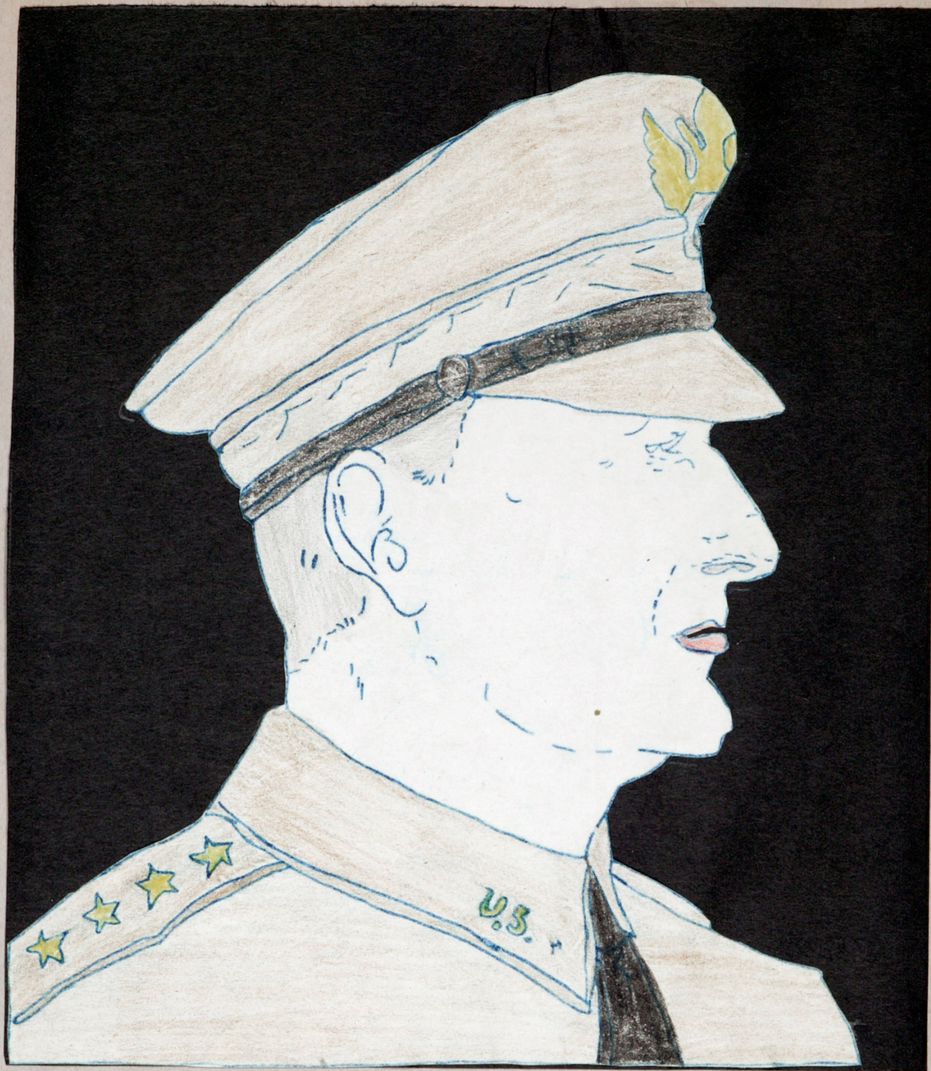
General Mac Arthor