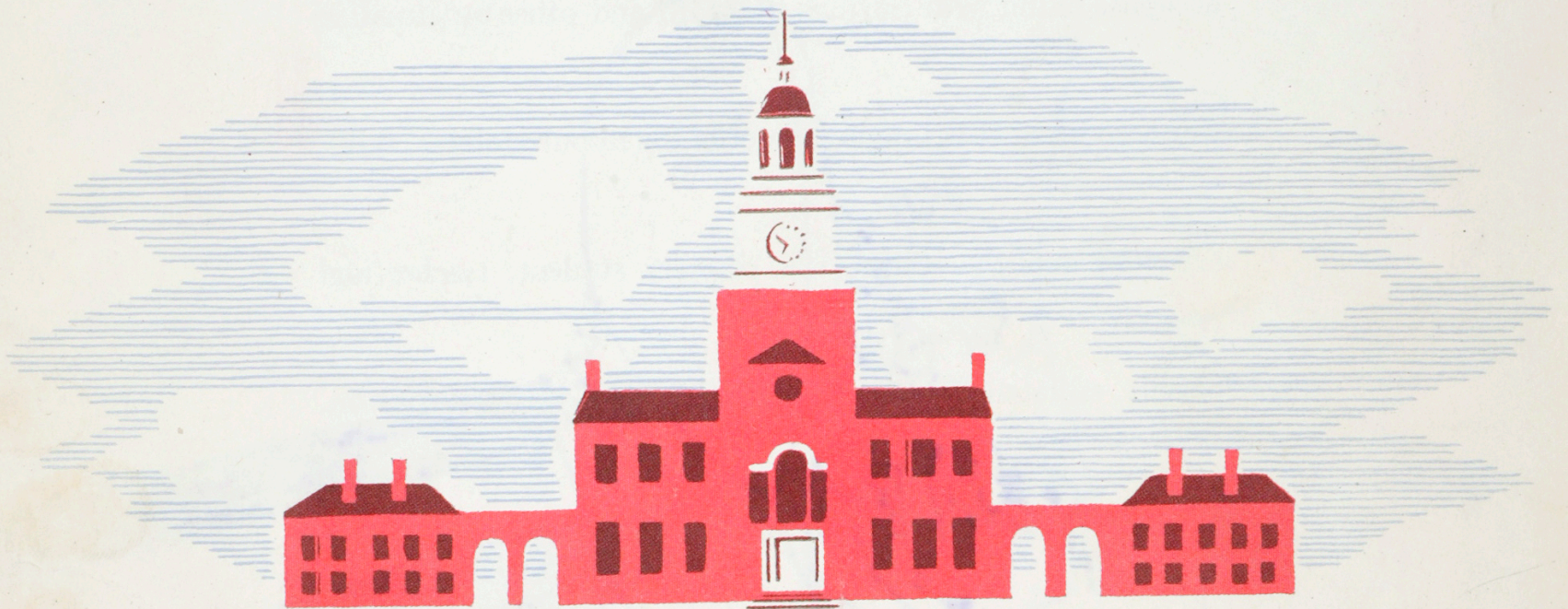
Independence Hall PHILADELPHIA 1776

SPONSORED BY * * THE WAR SAVINGS STAFF OF THE U. S. TREASURY DEPARTMENT, THE U. S. OFFICE OF EDUCATION AND ITS WARTIME COMMISSION