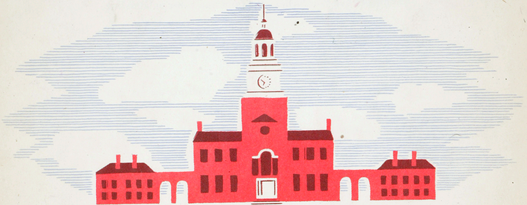
Independence Hall PHILADELPHIA 1776

SPONSORED BY * * THE WAR SAVINGS STAFF OF THE U. S. TREASURY DEPARTMENT, THE U. S. OFFICE OF EDUCATION AND ITS WARTIME COMMISSION