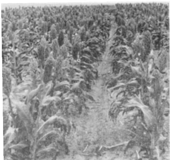
Dwarf Kafir 44-14—A high yielding variety suitable for combine harvesting.

Dwarf Kafir 44-14: Dwarf Kafir 44-14 was developed in Oklahoma to meet the need for a variety of kafir which can be harvested with combines. The variety is earlier than Standard kafir and matures in about the same time as Sharon. It is very uniform in appearance and has produced high yields at both Stillwater and Woodward. Dwarf kafir 44-14 is resistant to milo disease and has more resistance to chinch bug injury than the combine milos. It also has a wider range of adaptation than the combine milos and is recommended throughout the main sorghum-producing section of the state.