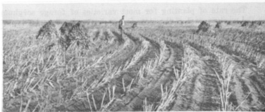
Sorghums should be planted on the contour. When harvesting for forage, the stalks should be cut, leaving as much stubble as possible for protection against soil blowing.

Planting may be done with a lister planter or with a one-row or two-row corn planter. Special sorghum plates are available for planters. Seed should be planted in moist soil and covered in a depth of one to two inches.