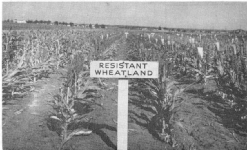
Wheatland—A disease-resistant combine milo.

Wheatland (Resistant): Resistant Wheatland is a selection of Wheatland made at the Garden City Station. In plant characteristics, it is similar to Westland, and is resistant to milo disease. The variety is slightly later than Westland, and under average conditions, it produces higher yields of grain. It is recommended in the west-central and southwest parts of the state.