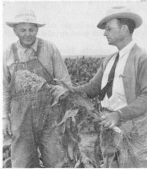
Inspecting a field of kafir for certification.

High quality seed of an adapted variety is an important factor in producing a good crop. Certified seed is the best class of seed available for general distribution. It is produced from approved seed stocks of known origin and is grown by farmers who specialize