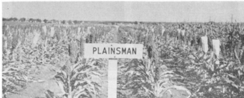
Plainsman—A resistant milo grown extensively in southwest Oklahoma.

Plainsman: Plainsman was developed by the Texas Experiment Station. The heads are long and cylindrical, resembling kafir. Plainsman matures in about 110 days and is approximately one week later than Westland. The variety is resistant to milo disease. Plainsman is recommended in the southwest part of the state.