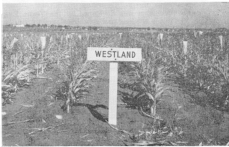
Westland—An early maturing, disease-resistant combine milo.

Westland: Westland, a selection of Wheatland made at the Garden City (Kansas) Experiment Station, is resistant to milo disease. It matures in about 105 days and produces high yields of grain. Westland is recommended in the northwest part of the state.