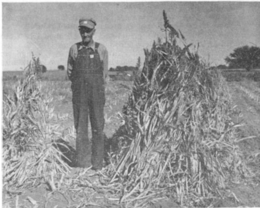
Fertilizer increased the yield of sorghum forage from 1900 pounds to 9900 pounds per acre (Field weight).

When fertilizers are applied in direct contact with sorghum seeds, injury to germination may result. The best placement of fertilizer for sorghums is in a band along the row 2 inches to the side and 1 to 2 inches below the level of the seed. The next best placement is 2 to 3 inches directly below the seed.