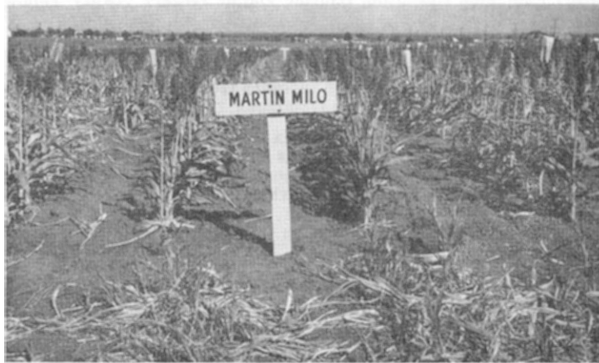
Martin milo—Southern Great Plains Station, Woodward.

Martin: Martin Milo was developed in Texas and is resistant to milo disease. It matures in about 100 days. Martin does not yield as much as the later combine varieties under favorable conditions, but it is more likely to produce grain consistently under less favorable conditions.