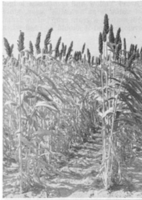
Sugar Drip is grown for both forage and sirup.

Atlas: Atlas is a forage sorghum with medium sized heads and white grain. Under favorable conditions, it produces high yields of sweet, juicy forage and a grain yield often equal to the best grain sorghums. Atlas has become very popular as a silage sorghum and is adapted on good soils in the northern half of the state.