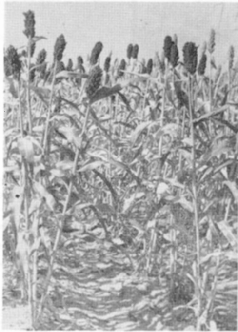
Sumac 1712 —One of the most popular forage sorghums in Oklahoma. Also a good syrup variety.

Sumac 1712: Sumac 1712 is a selection of Sumac Sorgo (Red Top) which has proved very satisfactory under Oklahoma conditions. It is medium maturing and has sweet, juicy stalks. The variety is adapted to all of Oklahoma except the extreme northwest section. It can be utilized as bundle feed, hay, or silage. Sumac 1712 is less susceptible to lodging and is more easily harvested than the taller varieties. It is drought resistant and produces excellent yields of forage. It is also a good syrup variety. Because of its wide adaptation and reliable yielding ability, Sumac 1712 is grown extensively in the state.