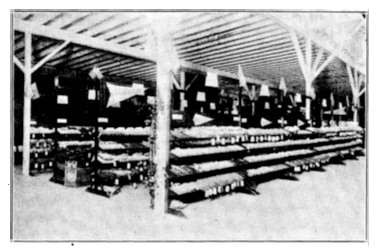
Corn, Cotton, Kafir Exhibit at State Fair, 1915