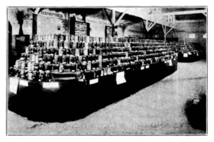
Canning Club Exhibit at State Fair, 1915