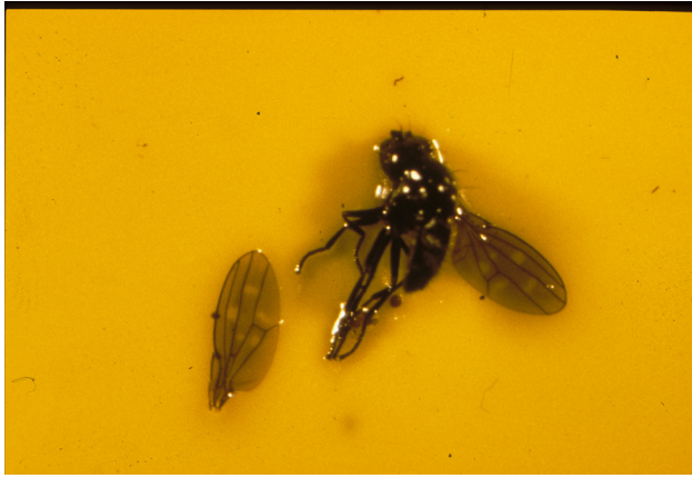
Figure 3. Shore fly adult caught on a yellow sticky card. Note clear spots on wings.

shore flies have larger, more robust bodies and relatively shorter legs and antennae. Eggs are laid in areas of algal growth and larvae hatch within four to six days following oviposition. There are three larval stages; mature larvae measure about 1/4 inch long and are opaque, yellowish brown, and lack a head capsule. The life cycle is complete in 15 to 20 days, depending on temperature. Larvae feed primarily on algae and are not known to feed on plants, but adults deposit feces on leaves, causing a reduction in aesthetic quality. Additionally, adult shore flies are known to transmit black root rot and water-mold fungus in their feces, especially under wet conditions.