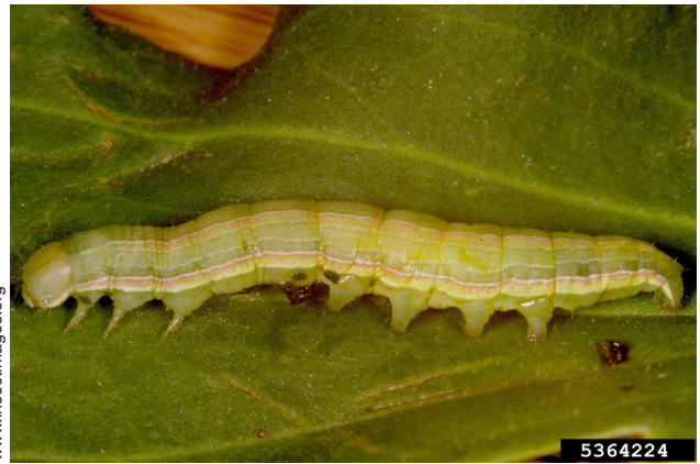
Figure 10. Beet armyworm caterpillar. Note the three pairs of true legs near the head and five pairs of fleshy, abdominal prolegs.