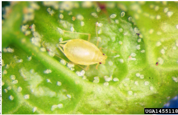
Figure 1. Green peach aphid adults, winged (top) and wingless (bottom).

face of the body and a dark spot can be seen on the abdomen. Using a hand lens, a distinguishing feature can be observed: a small indentation is present at the front and top of the head. Also, the antennae are long enough to reach the cornicles, and the base of each antenna bears an inwardly projecting bump (tubercle) that is only visible with a compound microscope. Green peach aphid feeds on more than 100 plant species, including a wide variety of vegetable and ornamental plants.