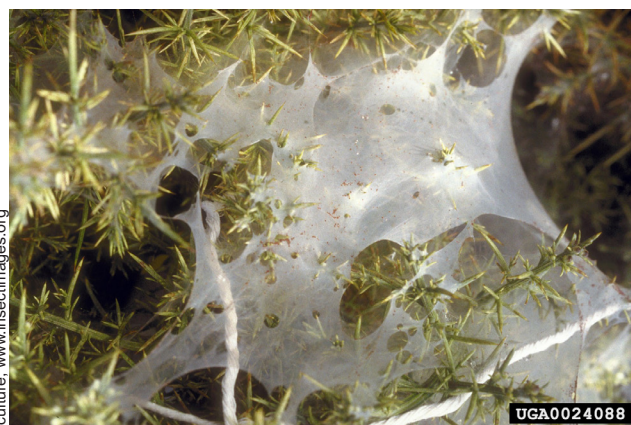
Figure 8. Adult two-spotted spider mites (top) and webbing produced by gorse spider mite (bottom).