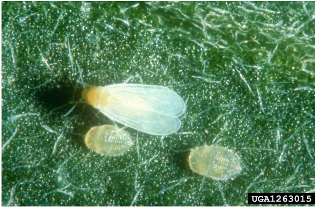
Figure 6. Adult and larvae of greenhouse whitefly.

heavy infestations, a “white cloud” appears during watering or when plants are disturbed. These insects feed through piercing-sucking mouthparts, sometimes causing stippling (small, discolored spots) on leaves. Plants eventually lose vigor as essential nutrients are withdrawn with the plant sap. Like their close relatives, whiteflies excrete honeydew, supporting the growth of black sooty mold on plant surfaces. Whiteflies are problematic for several reasons: they have high reproductive rates, rapidly develop resistance to insecticides, some can transmit plant viruses, and they attack a wide range of major ornamental crops. Poinsettia, chrysanthemum, fuchsia, many bedding plants, and tomatoes are particularly susceptible to whiteflies.