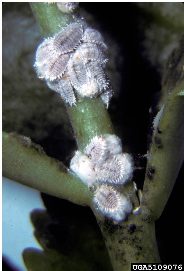
Figure 5. Adult citrus mealybugs on Kalanchoe, Kalanchoe spp.

rus mealybug, Planococcus citri (Figure 5). Citrus mealybugs have a white, powdery substance covering their bodies and white, waxy filaments projecting from the end of their abdomens. They also have shorter filaments of wax along the body margins and a faint, gray stripe running down the length of their body. This pest feeds on more than 27 families of host plants, including amaryllis, begonia, coleus, cyclamen, and dahlia.