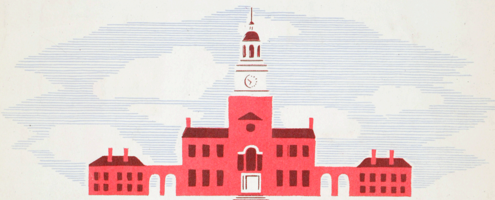
Independence Hall PHILADELPHIA 1776

SPONSORED BY • • THE WAR SAVINGS STAFF OF THE U. S. TREASURY DEPARTMENT, THE U. S. OFFICE OF EDUCATION AND ITS WARTIME COMMISSION