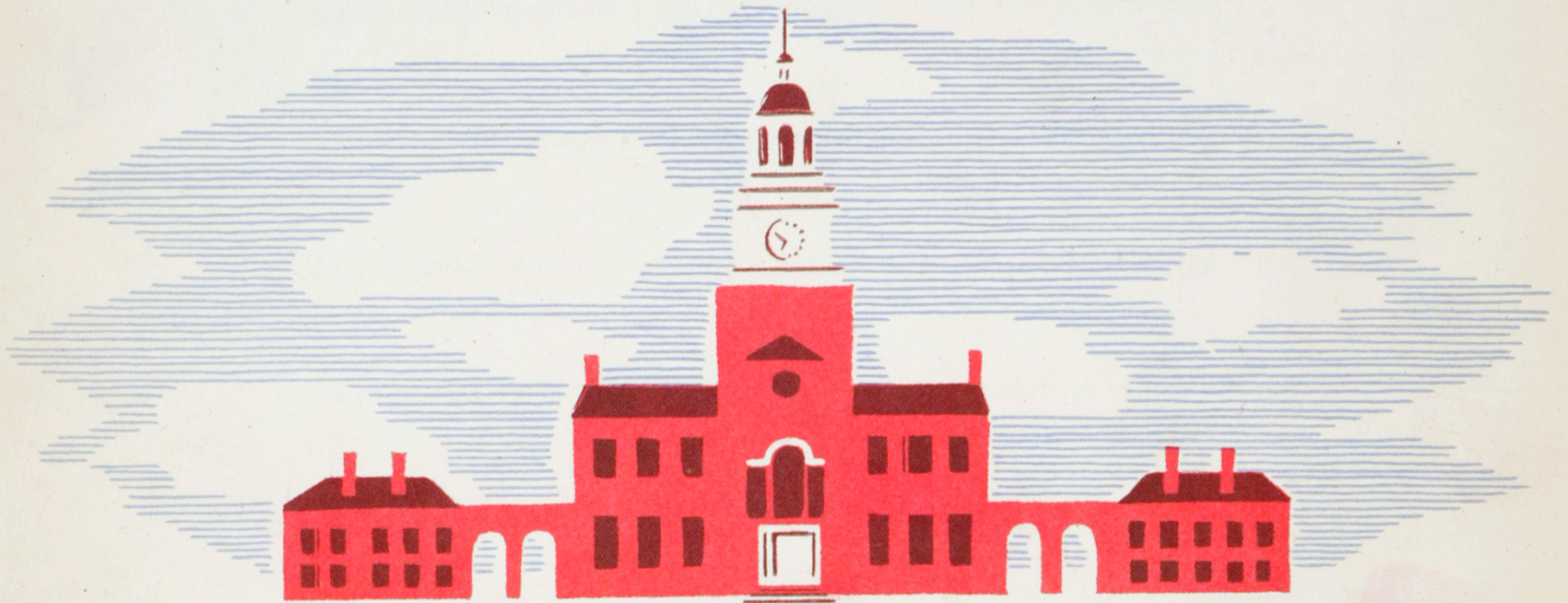
Independence Hall PHILADELPHIA 1776

SPONSORED BY • • THE WAR SAVINGS STAFF OF THE U. S. TREASURY DEPARTMENT, THE U. S. OFFICE OF EDUCATION AND ITS WARTIME COMMISSION