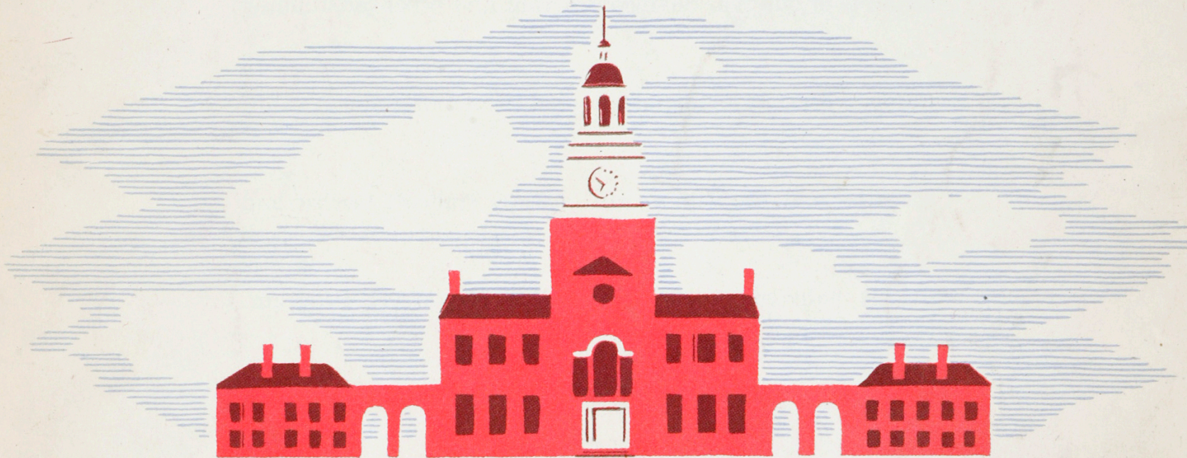
Independence Hall PHILADELPHIA 1776

SPONSORED BY * * THE WAR SAVINGS STAFF OF THE U. S. TREASURY DEPARTMENT, THE U. S. OFFICE OF EDUCATION AND ITS WARTIME COMMISSION