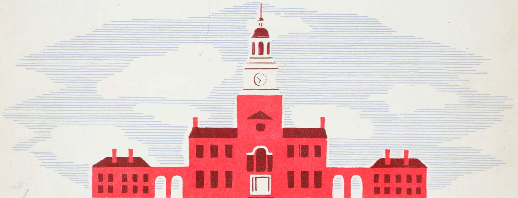
Independence Hall PHILADELPHIA 1776

SPONSORED BY • • THE WAR SAVINGS STAFF OF THE U. S. TREASURY DEPARTMENT, THE U. S. OFFICE OF EDUCATION AND ITS WARTIME COMMISSION