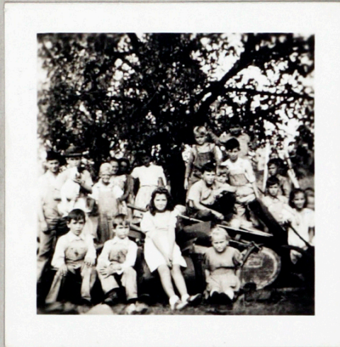
and part of the Scrap