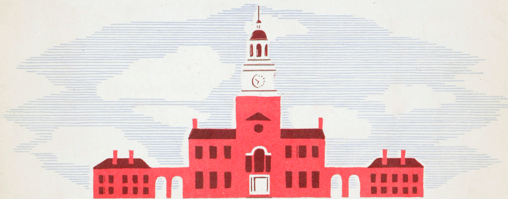
Independence Hall PHILADELPHIA 1776

SPONSORED BY • • THE WAR SAVINGS STAFF OF THE U. S. TREASURY DEPARTMENT, THE U. S. OFFICE OF EDUCATION AND ITS WARTIME COMMISSION