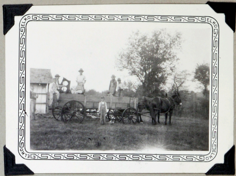
Mr. Pitts takes time out to help the boys bring a load of scrap which was too heavy for them to bring -