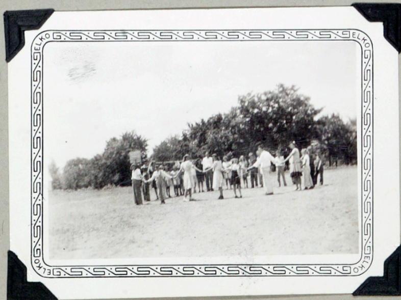
Chapel School children at play -

All children were given an examination by the County Doctor - Tests for diseases were given and vaccination were given to every child needing them.