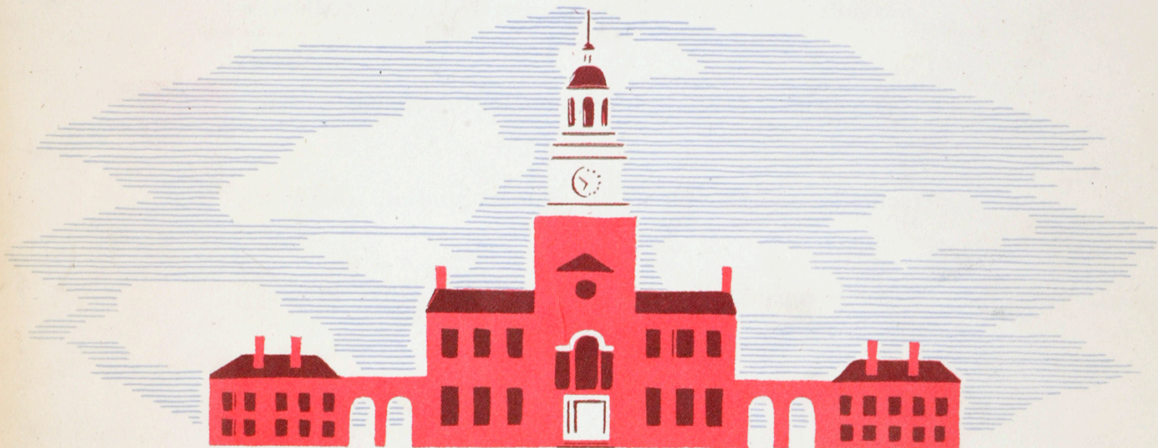
Independence Hall PHILADELPHIA 1776

SPONSORED BY * * THE WAR SAVINGS STAFF OF THE U. S. TREASURY DEPARTMENT, THE U. S. OFFICE OF EDUCATION AND ITS WARTIME COMMISSION