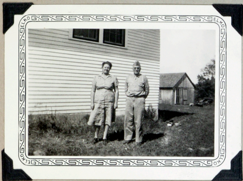
County Health Nurse and Dr.