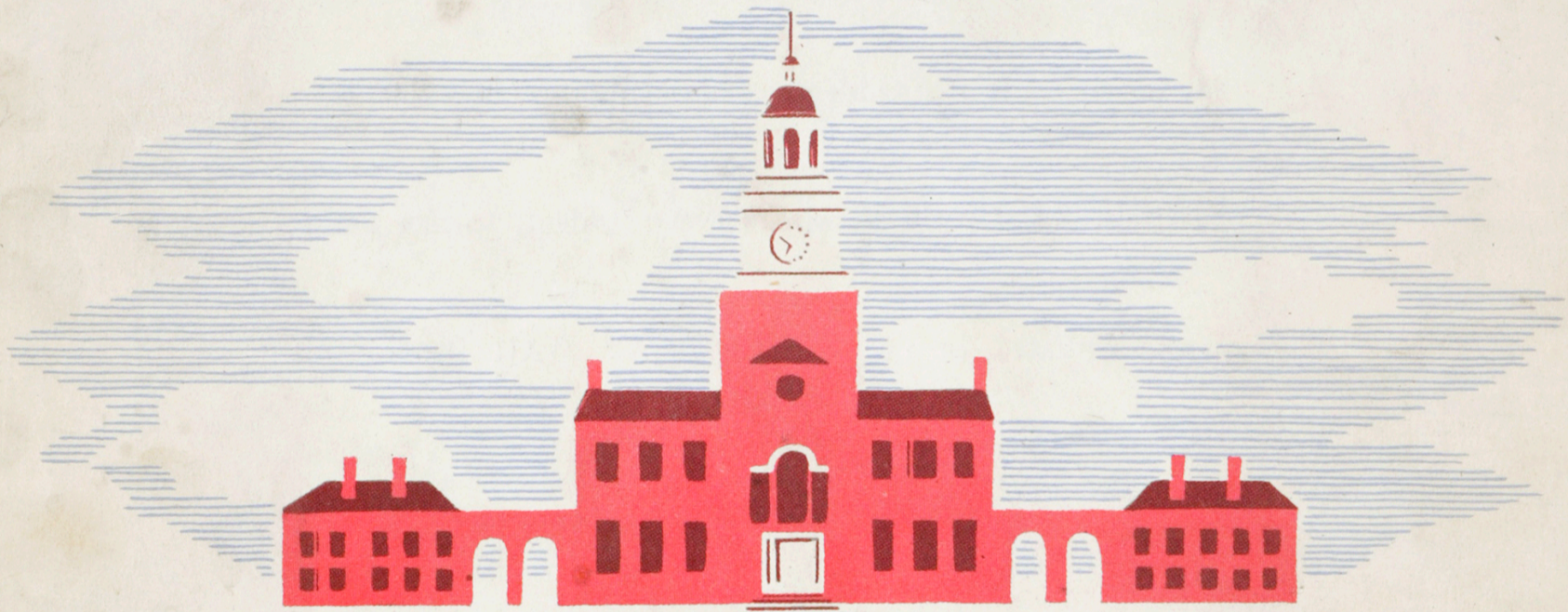
Independence Hall PHILADELPHIA 1776